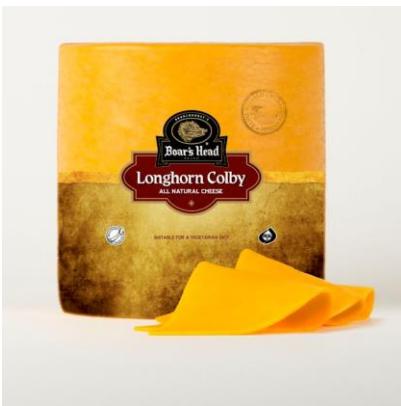
LONGHORN COLBY 701 3.25 LB | 4 PER CASE