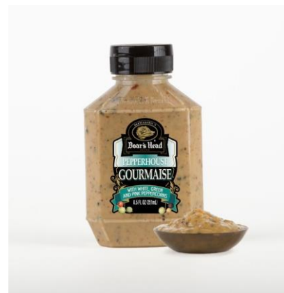
SQZ PEPPERHOUSE GOURMAISE 16135 8.5 OZ | 12 PER CASE