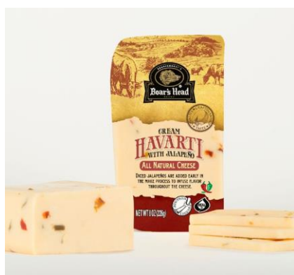
PC HAVARTI JALAPENO 978 8 OZ | 10 PER CASE