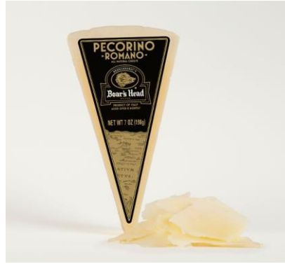
PC PECORINO ROMANO 15160 7 OZ | 14 PER CASE