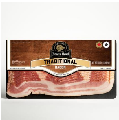
RAW IMPORTED BACON 1LB 542 16 OZ | 12 PER CASE