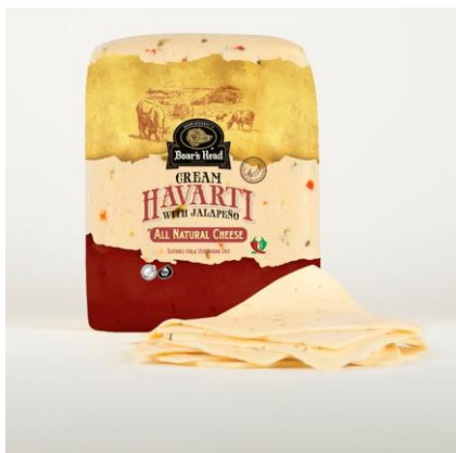
HAVARTI JALAPENO 727 4.5 LB | 2 PER CASE