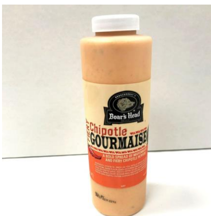
CHIPOTLE GOURMAISE 16257 16 OZ | 6 PER CASE