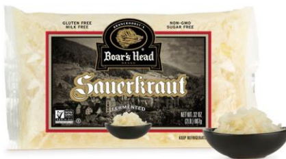
SAUERKRAUT 2LB 730 32 OZ | 12 PER CASE