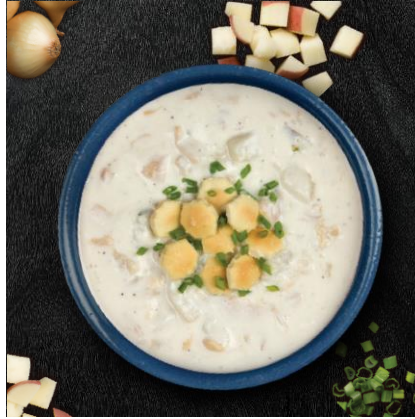
NEW ENGLAND CLAM CHOWDER 16011 8 LB | 2 PER CASE