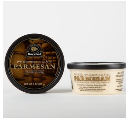
GRATED PARMESAN 859 6 OZ | 12 PER CASE SPECIAL ORDER