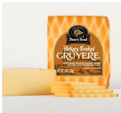
PC SMOKED GRUYERE 975 8 OZ | 10 PER CASE