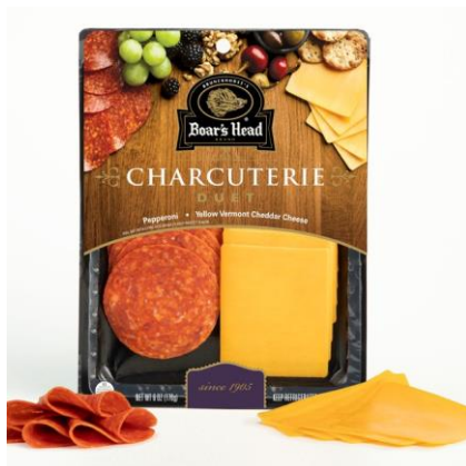
CHARCUTERIE DUET PEPPERONI & CHEDDAR 16274 6 OZ | 12 PER CASE