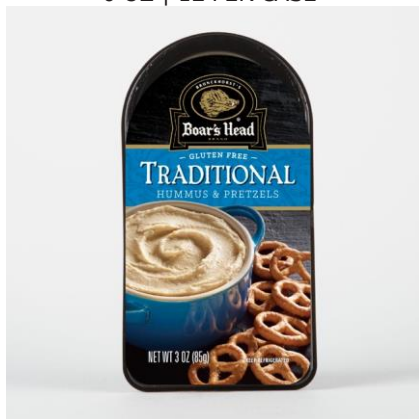
HUMMUS & PRETZELS 16158 3 OZ | 12 PER CASE