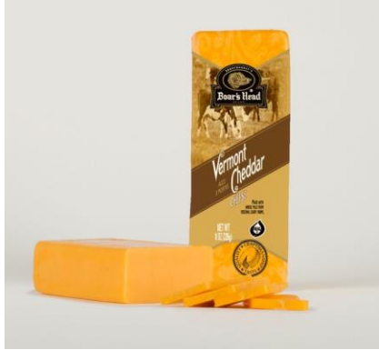
PC VERMONT YELLOW 15011 8 OZ | 10 PER CASE