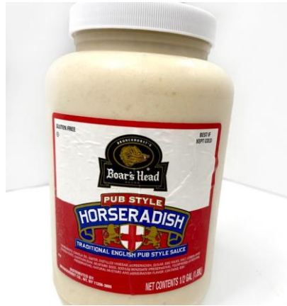
HORSERADISH 8779 1/2 GALLON | 4 PER CASE