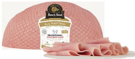
ALL-NATURAL UNCURED HAM 346 3.5 LB | 4 PER CASE