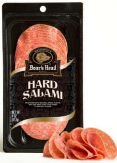
PS HARD SALAMI 50002 4 OZ | 12 PER CASE