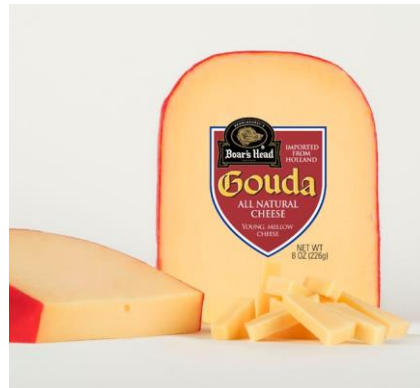
PC DUTCH GOUDA 973 8 OZ | 10 PER CASE

NO GLUTEN* | NO ARTIFICIAL COLORS OR FLAVORS | NO MSG ADDED | NO FILLERS OR BY PRODUCTS | NO TRANS FAT** *All Boar's Head meats, cheeses, spreads and condiments are gluten free. **No trans-fats from partially hydrogenated oils