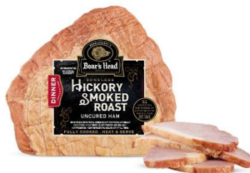
HICKORY SMOKED HAM 11085 2 LB | 5 PER CASE