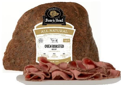
ALL-NATURAL OVEN ROASTED BEEF 349 3 LB | 2 PER CASE