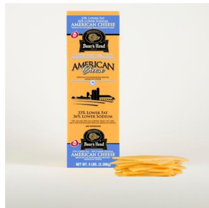
LS/LF AMERICAN YELLOW 712 5 LB | 2 PER CASE