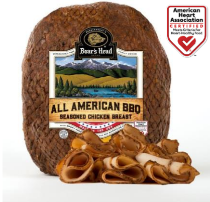
ALL AMERICAN BBQ CHICKEN 13013 4.5 LB | 3 PER CASE