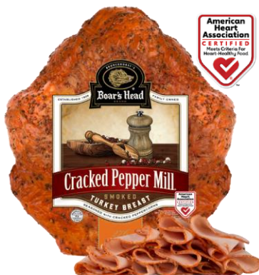
CRACKED PEPPERMILL TURKEY 276 4.5 LB | 4 PER CASE