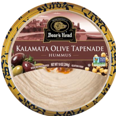
KALAMATA OLIVE TAPENADE HUMMUS 16196 10 OZ | 12 PER CASE