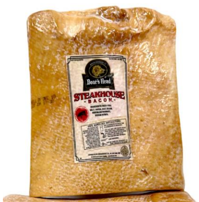
STEAKHOUSE SLAB BACON 336 3.2 LB | 3 PER CASE SPECIAL ORDER