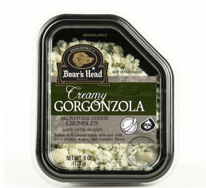
CRUMBLED GORGONZOLA 931 6 OZ | 6 PER CASE