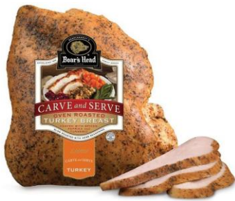
CARVE & SERVE TURKEY 13001 3.5 LB | 6 PER CASE