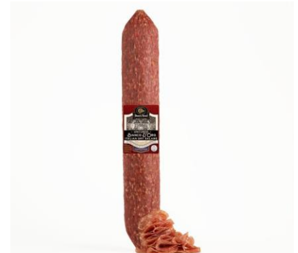
BIANCO D'ORO SALAMI 568 3 LB | 5 PER CASE