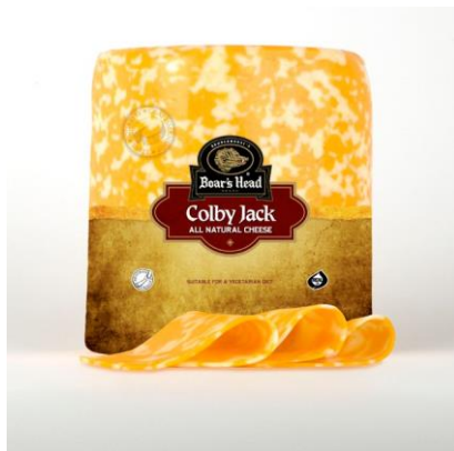
COLBY JACK 700 3.25 LB | 4 PER CASE