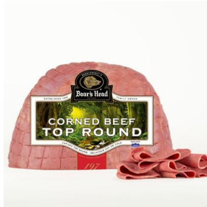
TOP ROUND CORNED BEEF 197 5.5 LB | 4 PER CASE