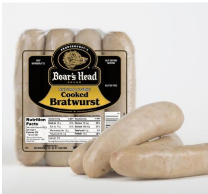
NATURAL CASING COOKED BRATWURST 399 16 OZ | 12 PER CASE