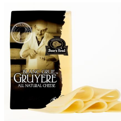
BLANC GRUERE GRUYERE 15149 4 LB | 2 PER CASE