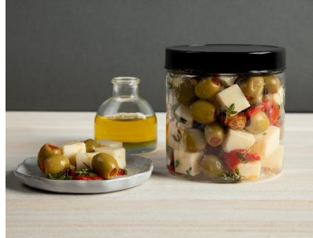
MANZANILLA OLIVE BLEND PAIRED WITH BOAR'S HEAD GOAT CHEESE (15024) 70074 36 OZ | 4 PER CASE