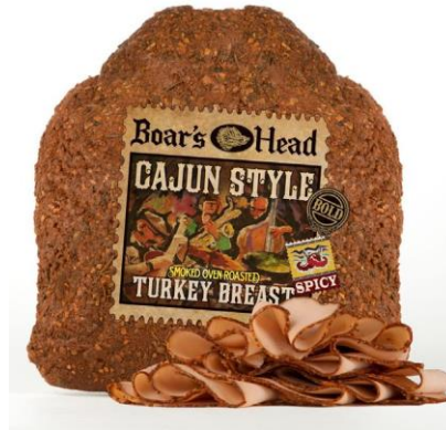
BOLD CAJUN TURKEY 296 4.5 LB | 4 PER CASE