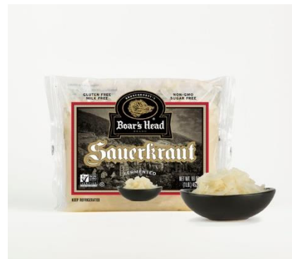
SAUERKRAUT 1LB 731 16 OZ | 12 PER CASE