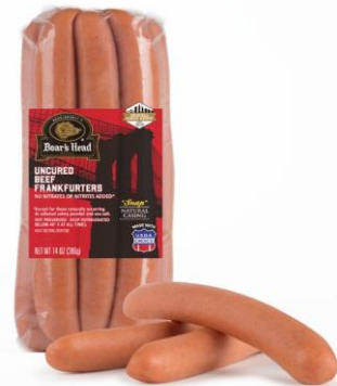
N/C UNCURED BEEF FRANKS 14008 14 OZ | 24 PER CASE