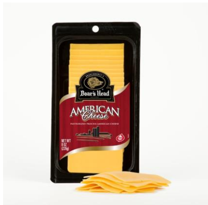
PS AMERICAN YELLOW 50001 8 OZ | 12 PER CASE