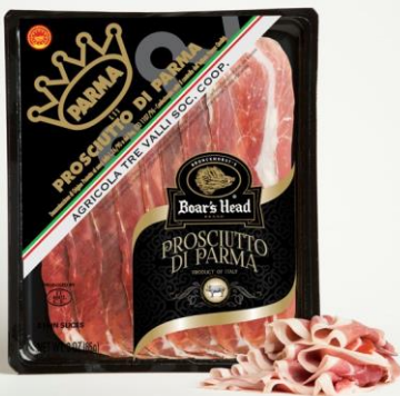
PS PROSCIUTTO DI PARMA 50037 3 OZ | 12 PER CASE