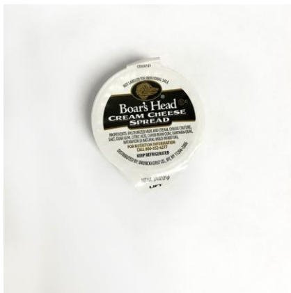
CREAM CHEESE CUPS 15124 3/4 OZ | 100 PER CASE SPECIAL ORDER