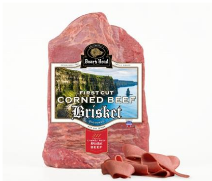
RAW CORNED BEEF BRISKET 211 3 LB | 5 PER CASE