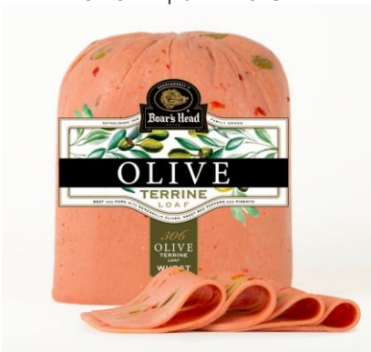
OLIVE LOAF 306 4.5 LB | 4 PER CASE