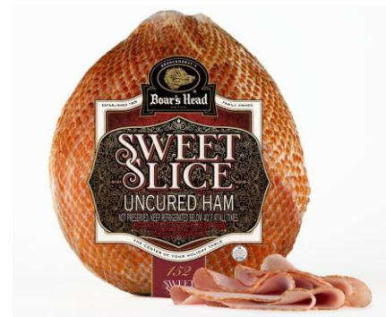
SWEET SLICE HAM 153 6 LB | 5 PER CASE