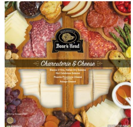
CHARCUTERIE SAMPLER 2 MEAT 2 CHEESE 16245 12 OZ | 10 PER CASE