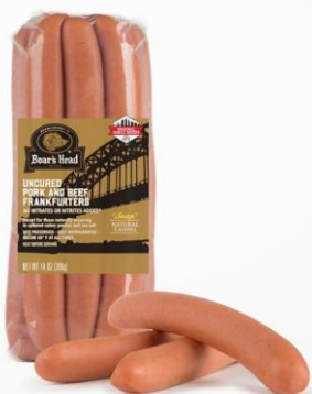
N/C UNCURED PORK & BEEF FRANKS 14010 14 OZ | 24 PER CASE