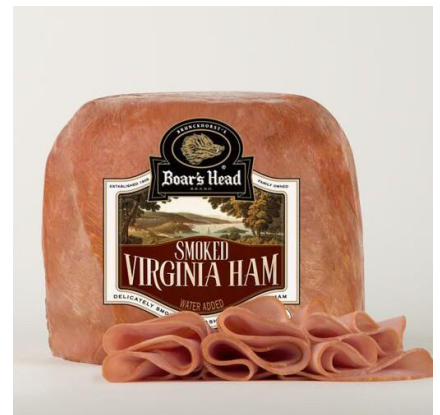
SMOKED VIRGINIA HAM 156 4.5 LB | 6 PER CASE