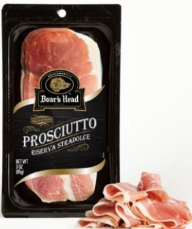
PS PROSCIUTTO 50019 3 OZ | 12 PER CASE