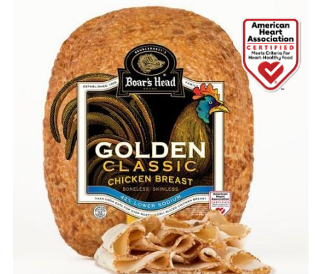
GOLDEN CLASSIC CHICKEN 437 4.5 LB | 3 PER CASE