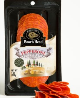
PS PEPPERONI 50017 4 OZ | 12 PER CASE