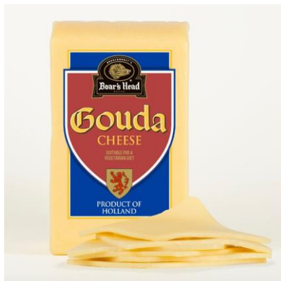
OLD WORLD GOUDA 15025 4 LB | 3 PER CASE