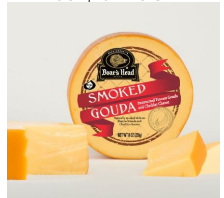
PC SMOKED GOUDA 15062 8 OZ | 10 PER CASE