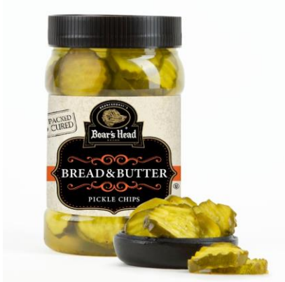
BREAD & BUTTER PICKLE CHIPS 16224 26 OZ | 12 PER CASE 50-60 CHIPS PER JAR