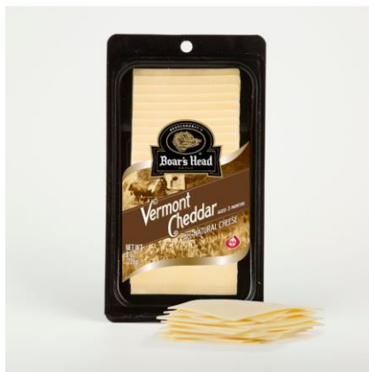
PS VERMONT WHITE 50009 8 OZ | 12 PER CASE