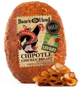
BOLD FIREY CHIPOTLE CHICKEN 13034 4 LB | 3 PER CASE