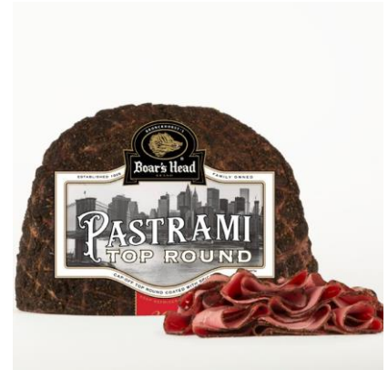
TOP ROUND PASTRAMI 205 5.5 LB | 4 PER CASE