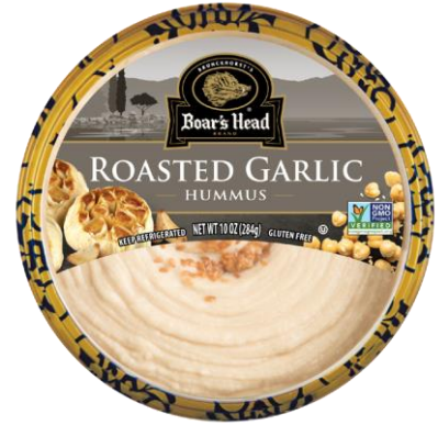
ROASTED GARLIC HUMMUS 16161 10 OZ | 12 PER CASE