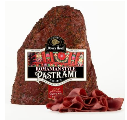
ROMANIAN PASTRAMI ROUND 238 5 LB | 6 PER CASE