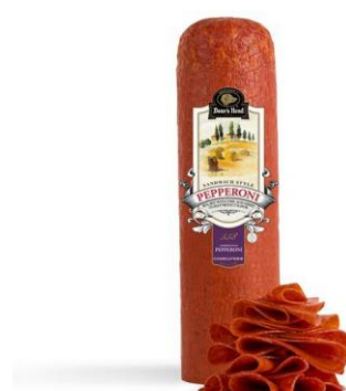
SANDWICH PEPPERONI 558 3.4 LB | 3 PER CASE