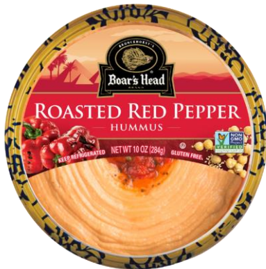
RED PEPPER HUMMUS 16162 10 OZ | 12 PER CASE