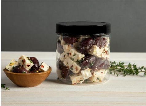
KALAMATA OLIVE BLEND PAIRED WITH BOAR'S HEAD FETA CHEESE (748) 70076 24 OZ | 6 PER CASE