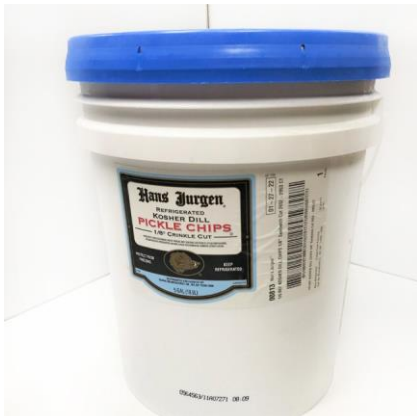
PICKLE CHIPS 813 2900-3100 COUNT | 5 GALLON

NO GLUTEN* | NO ARTIFICIAL COLORS OR FLAVORS | NO MSG ADDED | NO FILLERS OR BY PRODUCTS | NO TRANS FAT** *All Boar's Head meats, cheeses, spreads and condiments are gluten free. **No trans-fats from partially hydrogenated oils