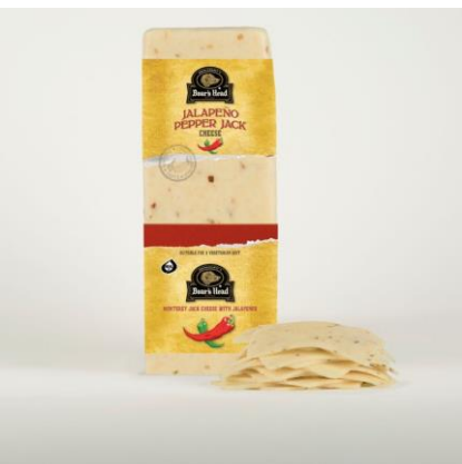
MONTEREY JACK JALAPENO 751 5 LB | 2 PER CASE