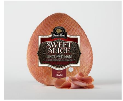
BABY SWEET SLICE HAM 182 3.5 LB | 5 PER CASE