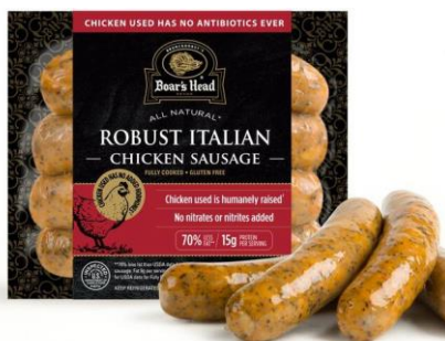
ROBUST ITALIAN CHICKEN SAUSAGE 14013 12 OZ | 12 PER CASE