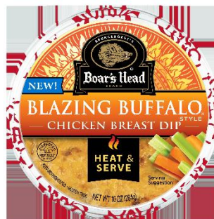
BUFFALO CHICKEN DIP 16293 10 OZ | 8 PER CASE