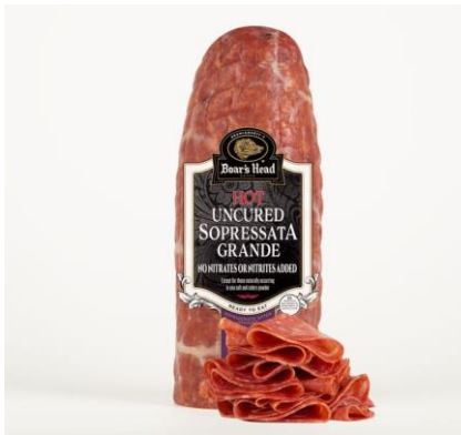
SOPRESSATA GRANDE 596 4.5 LB | 6 PER CASE