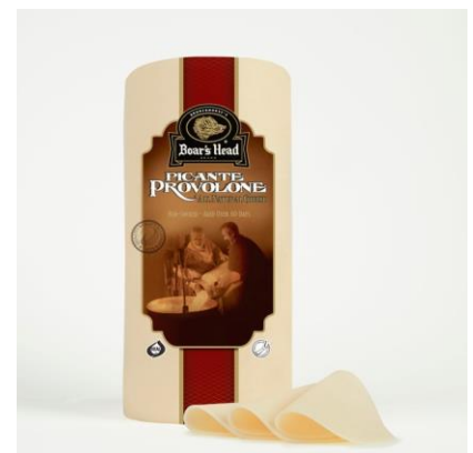
PICANTE PROVOLONE 648 6 LB | 4 PER CASE