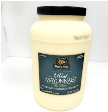
MAYO 16058 GALLON | 4 PER CASE