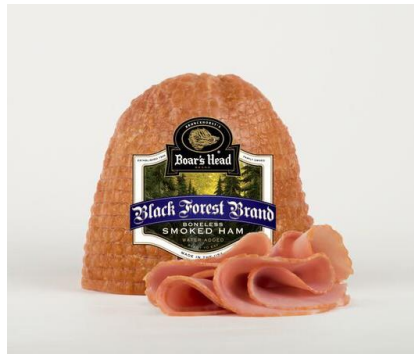
BABY BLACK FOREST HAM 192 1.5 LB | 5 PER CASE