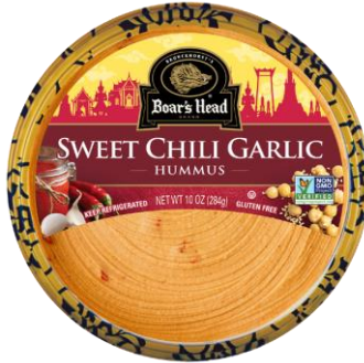
SWEET CHILI GARLIC HUMMUS 16246 10 OZ | 12 PER CASE