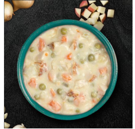
CHICKEN POT PIE SOUP 16090 8.16 LB | 2 PER CASE