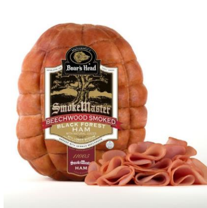
SMOKEMASTER BLACK FOREST HAM 11005 7.25 LB | 4 PER CASE