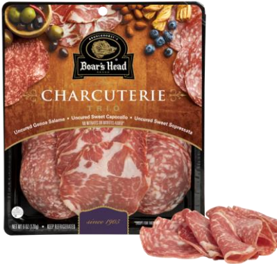
CHARCUTERIE TRIO 16271 6 OZ | 12 PER CASE