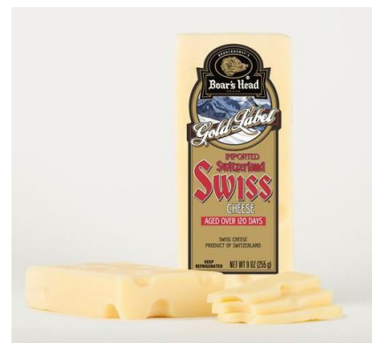
PC IMPORTED GOLD SWISS 985 9 OZ | 10 PER CASE