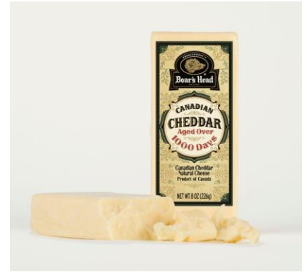
PC CANADIAN CHEDDAR 965 8 OZ | 10 PER CASE