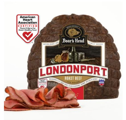
LONDONPORT ROAST BEEF 915 3 LB | 6 PER CASE

NO GLUTEN* | NO ARTIFICIAL COLORS OR FLAVORS | NO MSG ADDED | NO FILLERS OR BY PRODUCTS | NO TRANS FAT** *All Boar's Head meats, cheeses, spreads and condiments are gluten free. **No trans-fats from partially hydrogenated oils