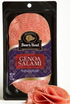
PS GENOA SALAMI 50015 4 OZ | 12 PER CASE