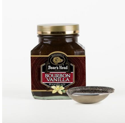
VANILLA BOURBON HAM GLAZE 16270 11 OZ | 12 PER CASE