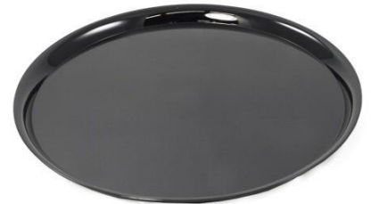
CATERING TRAY 96335 25 PER CASE