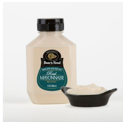
SQZ MAYONNAISE 16087 9 OZ | 12 PER CASE