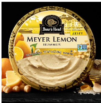
MEYER LEMON HUMMUS 16299 10 OZ | 12 PER CASE