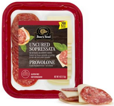
SOPRESSATA & PROVOLONE 16018 4 OZ | 12 PER CASE