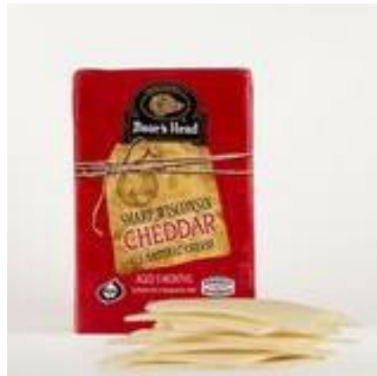
WISCONSIN SHARP RED WAX 15207 2.24 LB | 4 PER CASE