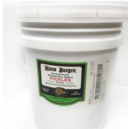
GARLIC PICKLES 795 40-50 COUNT | 5 GALLON