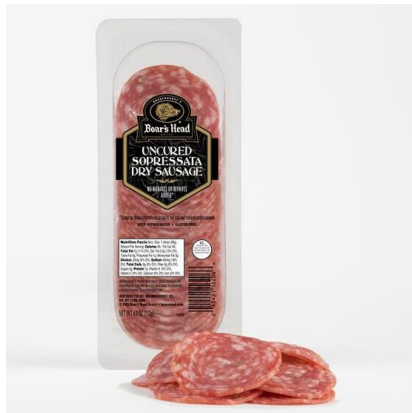
SLICED SOPRESSA SNACK TRAY 16206 4 OZ | 20 PER CASE