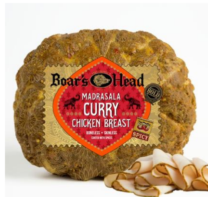
BOLD MADRASALA CURRY CHICKEN 13045 4 LB | 3 PER CASE