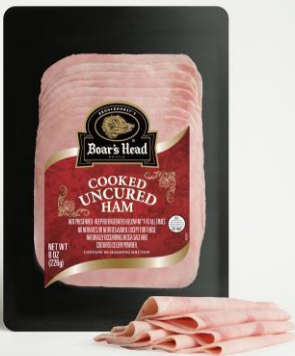
PS COOKED HAM 50027 8 OZ | 12 PER CASE