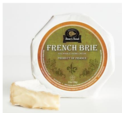
PC FRENCH BRIE WHEEL 15213 8.5 oz | 12 PER CASE