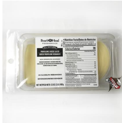
SLICED PROVOLONE 15189 44 SLICE PACK | 6 PER CASE