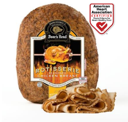
ROTISSERIE CHICKEN 438 4.5 LB | 3 PER CASE