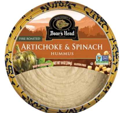
ARTICHOKE & SPINACH HUMMUS 16195 10 OZ | 12 PER CASE