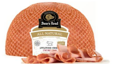
ALL-NATURAL APPLEWOOD HAM 348 3.5 LB | 4 PER CASE