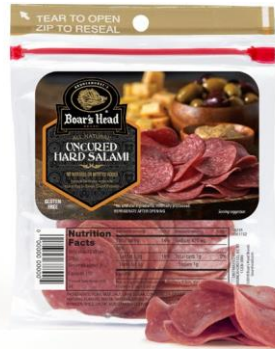
POUCH HARD SALAMI 16235 5 OZ | 16 PER CASE