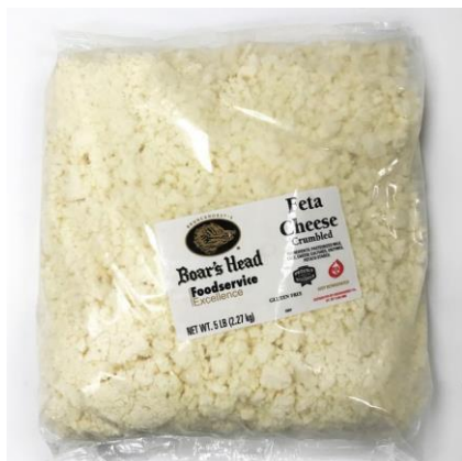
CRUMBLLED FETA 15007 5 LB | 2 PER CASE