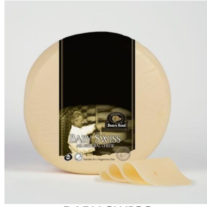
BABY SWISS 672 5 LB | 2 PER CASE