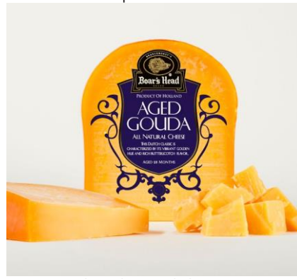
PC AGED GOUDA 15167 8 OZ | 10 PER CASE