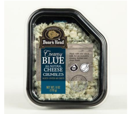
CRUMBLED BLUE 930 6 OZ | 6 PER CASE