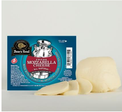
FRESH MOZZARELLA BALL 15145 8 OZ | 12 PER CASE