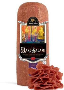
HARD SALAMI 557 3 LB | 8 PER CASE