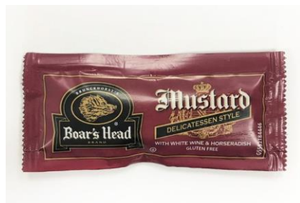
DELI MUSTARD PACKETS 743 250 PER CASE