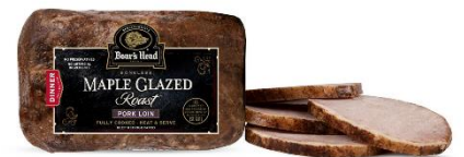
MAPLE GLAZED PORK LOIN 11083 2 LB | 5 PER CASE