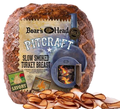
BOLD PITCRAFT SMOKED TURKEY 13063 4 LB | 3 PER CASE