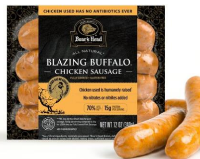
BLAZING BUFFALO CHICKEN SAUSAGE 14014 12 OZ | 12 PER CASE