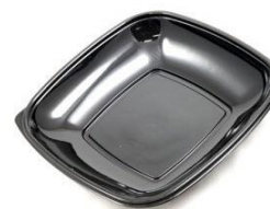
SALAD BOWL 90525 150 PER CASE