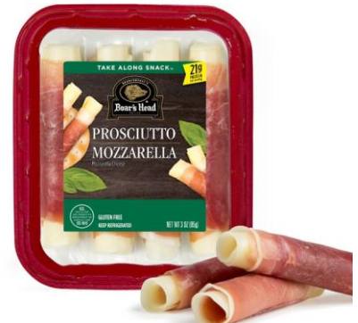
PROSCIUTTO & MOZZARELLA ROLL UP 16222 3 OZ | 12 PER CASE