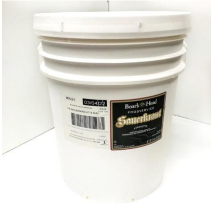
SAUERKRAUT 16031 5 GALLON SPECIAL ORDER