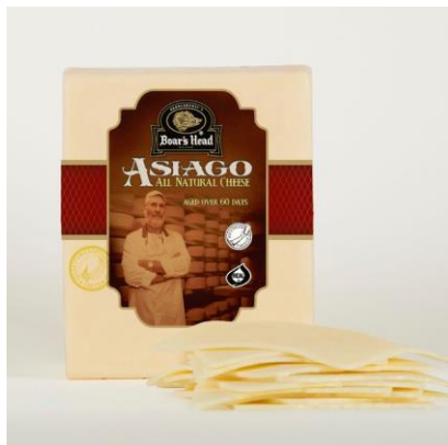
SLICING ASIAGO 15010 4 LB | 4 PER CASE