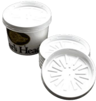
8/12/16 SOUP CUP LIDS 94003 50 PER SLEEVE | 1000 PER CASE