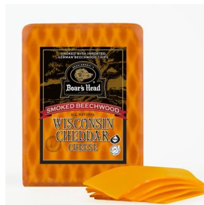
SMOKED WISCONSIN CHEDDAR 15179 4 LB | 2 PER CASE