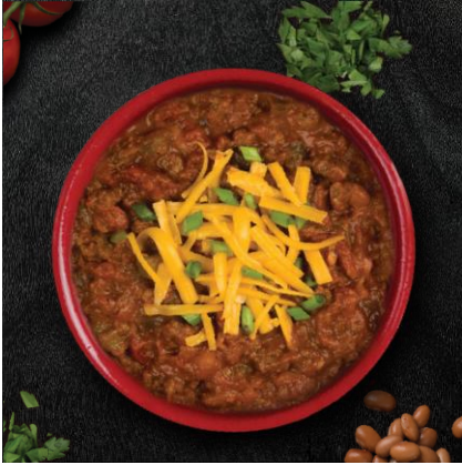
GROUND BEEF CHILI WITH BEANS 16006 8 LB | 2 PER CASE