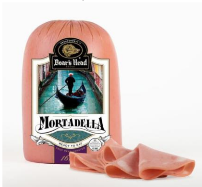
MORTADELLA 509 3.5 LB | 8 PER CASE