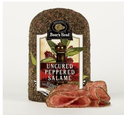
PEPPERED SALAMI 16146 4 LB | 2 PER CASE