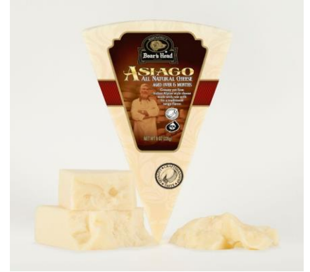
PC ASIAGO DOMESTIC 15022 8 OZ | 10 PER CASE