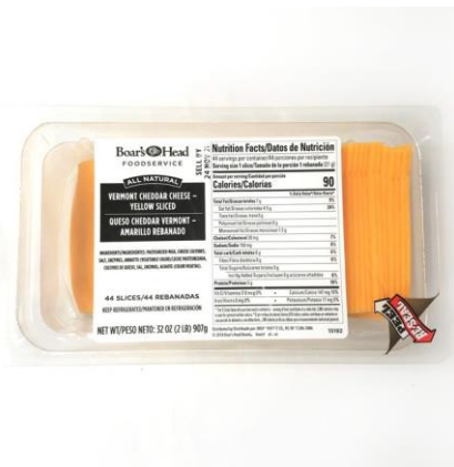
VERMONT YELLOW CHEDDAR 15192 44 SLICE PACK | 6 PER CASE