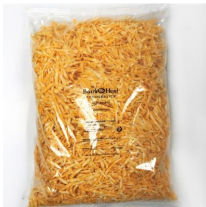
SHREDDED COLBY JACK 15118 5 LB | 6 PER CASE SPECIAL ORDER