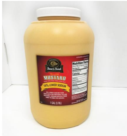
YELLOW MUSTARD 16204 GALLON | 4 PER CASE