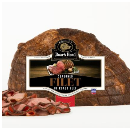
SEASONED FILET ROAST BEEF 246 5.5 LB | 4 PER CASE