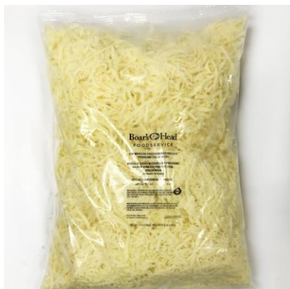
SHREDDED MOZZARELLA 15120 5 LB | 6 PER CASE SPECIAL ORDER