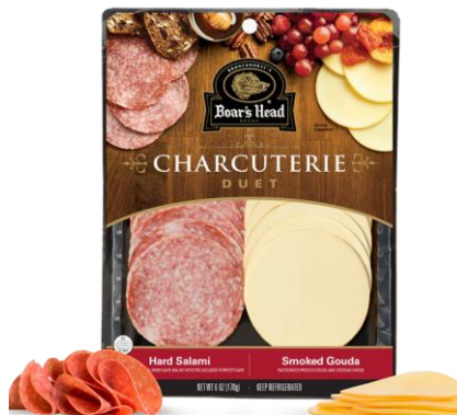
CHARCUTERIE DUET SALAMI & GOUDA 16275 6 OZ | 12 PER CASE