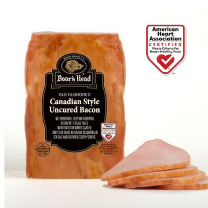
CANADIAN BACON 339 1.5 LB | 6 PER CASE SPECIAL ORDER