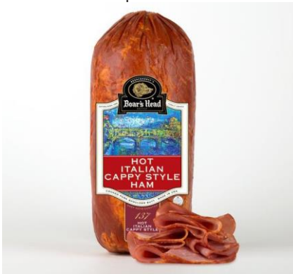
HOT ITALIAN CAPPY 137 3.5 LB | 5 PER CASE