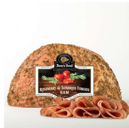
ROSEMARY HAM 173 4 LB | 5 PER CASE