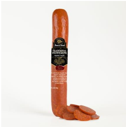
PEPPERONI STICK 16078 6.5 OZ | 20 PER CASE