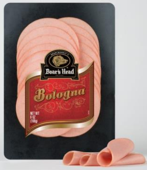
PS BOLOGNA 50030 6 OZ | 12 PER CASE