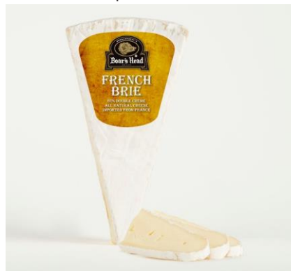
PC FRENCH BRIE WEDGE 15038 SIZE VARIES | 12 PER CASE