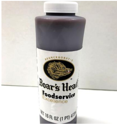
BBQ SAUCE 16269 16 OZ | 6 PER CASE