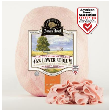
LOWER SODIUM TURKEY 421 6 LB | 3 PER CASE