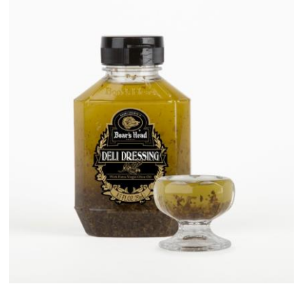
SQZ DELI DRESSING 788 8.5 OZ | 12 PER CASE