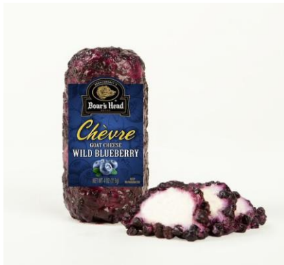
PC BLUEBERRY CHEVRE 15208 4 OZ | 12 PER CASE