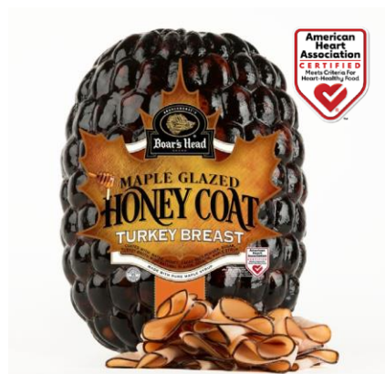
MAPLE HONEY TURKEY 270 5.5 LB | 3 PER CASE