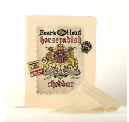
BOLD HORSERADISH CHEDDAR 627 5 LB | 2 PER CASE