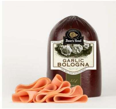
GARLIC BOLOGNA 354 3.75 LB | 4 PER CASE