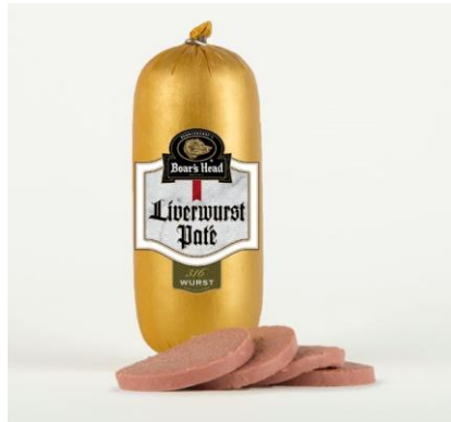
LIVERWURST PATE 316 8 OZ | 12 PER CASE