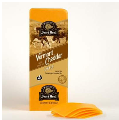
VERMONT YELLOW CHEDDAR 629 5.5 LB | 2 PER CASE