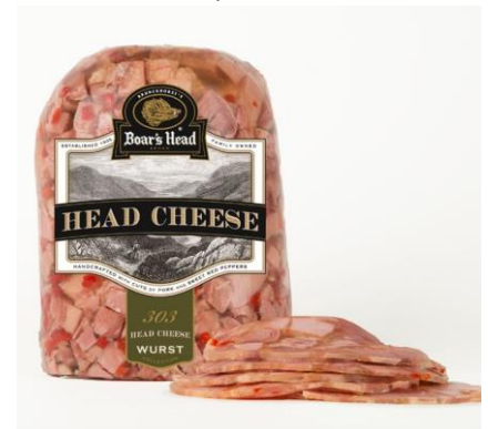
HEAD CHEESE 303 4 LB | 4 PER CASE