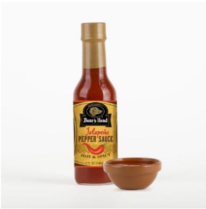
JALAPENO HOT SAUCE 896 5 OZ | 12 PER CASE