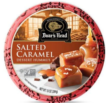
SALTED CARAMEL HUMMUS 16292 8 OZ | 12 PER CASE SEASONAL