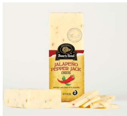
PC JALAPENO PEPPER JACK 980 8 OZ | 10 PER CASE