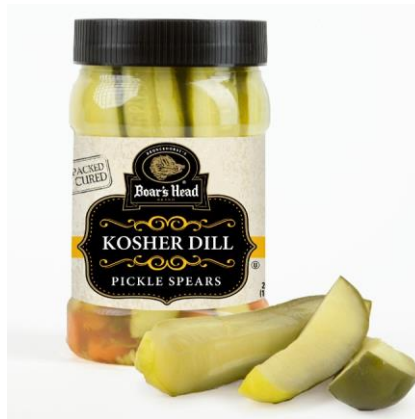
PICKLE SPEARS 486 26 OZ | 12 PER CASE 10-13 SPEARS PER JAR