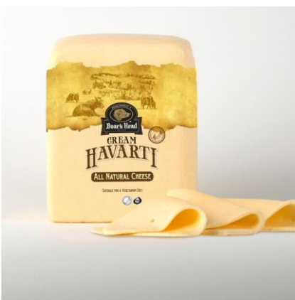
HAVARTI 725 4.5 LB | 2 PER CASE