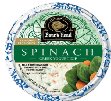
SPINACH GREEK YOGURT DIP 16282 12 OZ | 8 PER CASE