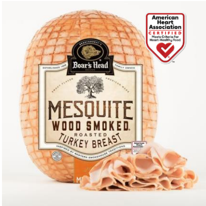
MESQUITE SMOKED TURKEY 294 6 LB | 3 PER CASE