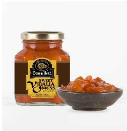
VIDALIA ONION JAR 956 9 OZ | 12 PER CASE