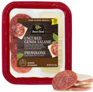
GENOA & PROVOLONE 16019 4 OZ | 12 PER CASE