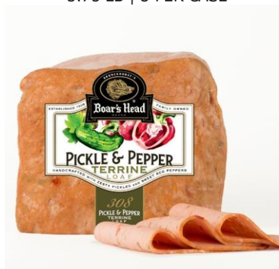
PICKLE AND PEPPER LOAF 308 3.5 LB | 4 PER CASE