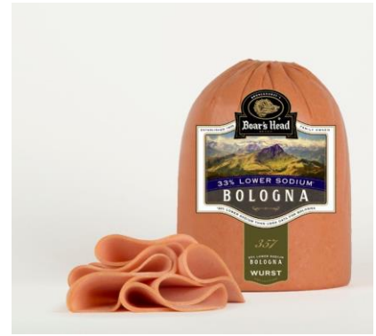
LOWER SODIUM BOLOGNA 357 3.75 LB | 4 PER CASE