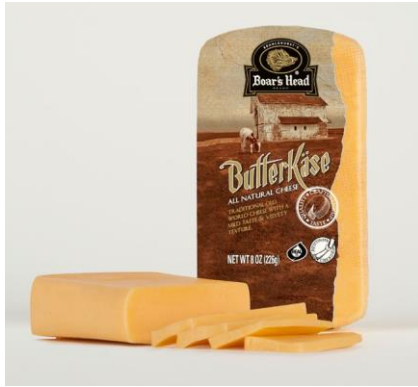
PC BUTTERKASE 961 8 OZ | 10 PER CASE