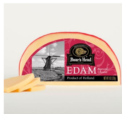
PC EDAM 970 8 OZ | 10 PER CASE