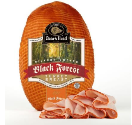
BLACK FOREST TURKEY 297 4 LB | 3 PER CASE