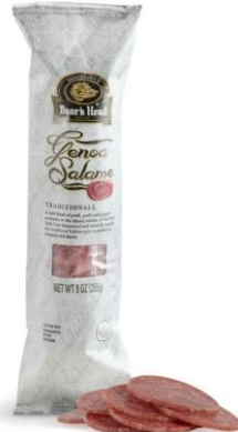
MINI GENOA SALAMI 16057 9 OZ | 16 PER CASE