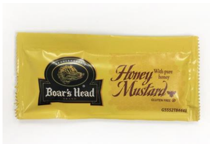
HONEY MUSTARD PACKETS 737 250 PER CASE