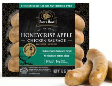
HONEYCRISP CHICKEN SAUSAGE 14018 12 OZ | 12 PER CASE