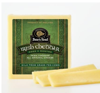
PC IRISH CHEDDAR 15212 7 OZ | 10 PER CASE