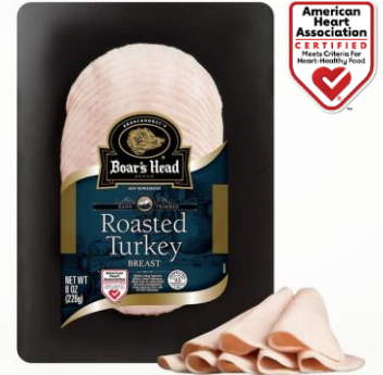
PS OVEN ROASTED TURKEY 50074 8 OZ | 12 PER CASE