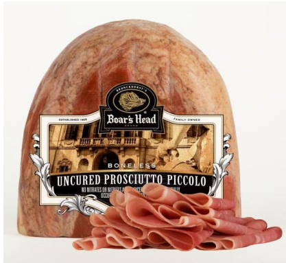
PROSCIUTTO PICCOLO 530 5 LB | 2 PER CASE