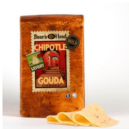
BOLD CHIPOTLE GOUDA 15060 4 LB | 2 PER CASE