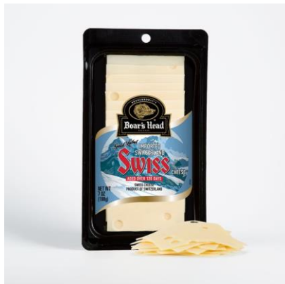
PS GOLD LABEL IMPORTED SWISS 50003 7 OZ | 12 PER CASE