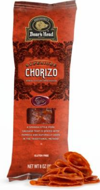
SUPERIORE CHORIZO SAUSAGE 16209 8 OZ | 16 PER CASE