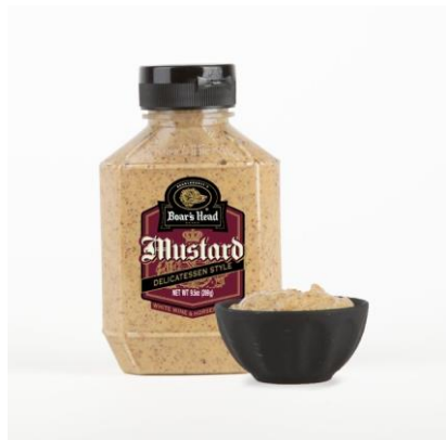
SQZ DELI MUSTARD 16001 9.5 OZ | 12 PER CASE