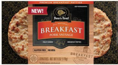
BREAKFAST SAUSAGE PATTIES 14029 6 OZ | 16 PER CASE