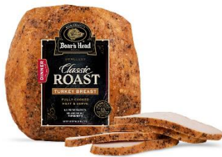
CLASSIC ROAST TURKEY 13077 2 LB | 5 PER CASE