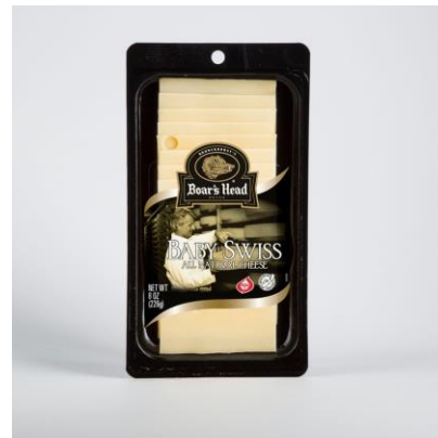
PS BABY SWISS 50006 8 OZ | 12 PER CASE