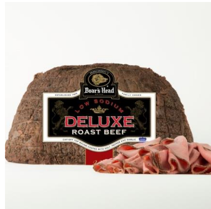
LOWER SODIUM DELUXE ROAST BEEF 235 5.5 LB | 4 PER CASE