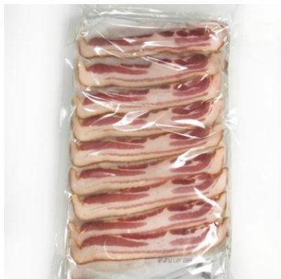
APPLEWOOD BACON 11003 10 LB BAG | 2 PER CASE 14-18 SLICES PER POUND