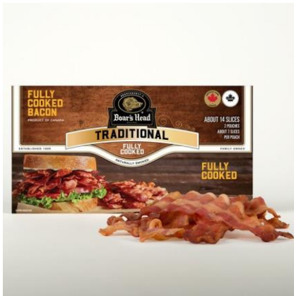
FULLY COOKED BACON 480 14 SLICES PER BOX | 24 PER CASE