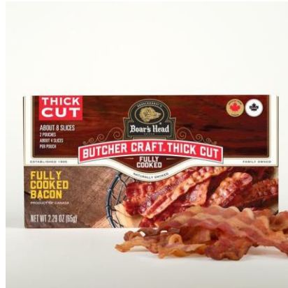
FULLY COOKED THICK CUT BACON 11059 8 SLICES PER BOX | 24 PER CASE