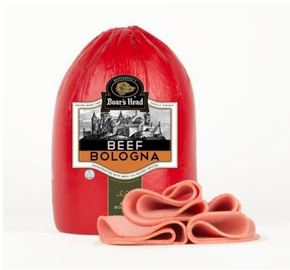
BEEF BOLOGNA 358 3.75 LB | 6 PER CASE