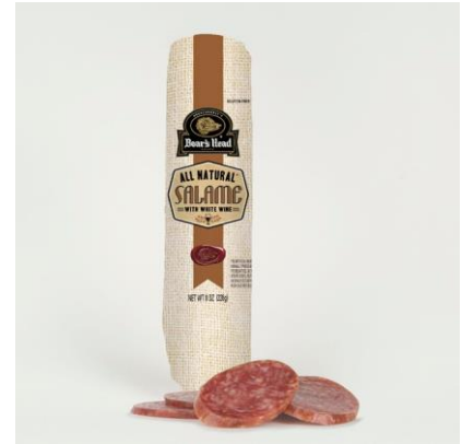
ALL NATURAL SALAMI W/ WINE 16073 8 OZ | 10 PER CASE