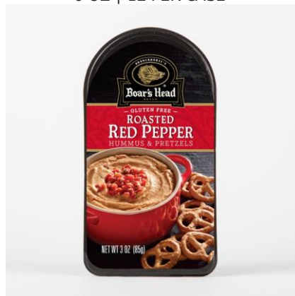
RED PEPPER HUMMUS & PRETZELS 16167 3 OZ | 12 PER CASE