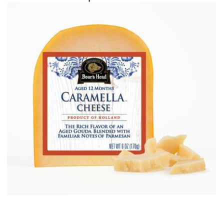
PC CARMELLA CHEESE 15181 6 OZ | 10 PER CASE