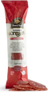
SUPERIORE SOPRESSATA PICCANTE 16190 9 OZ | 15 PER CASE