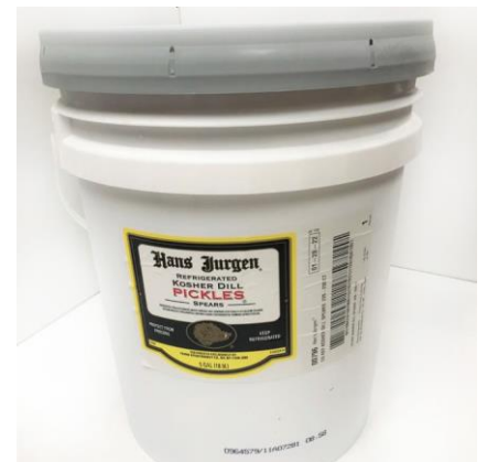
PICKLE SPEARS 796 220-240 COUNT | 5 GALLON