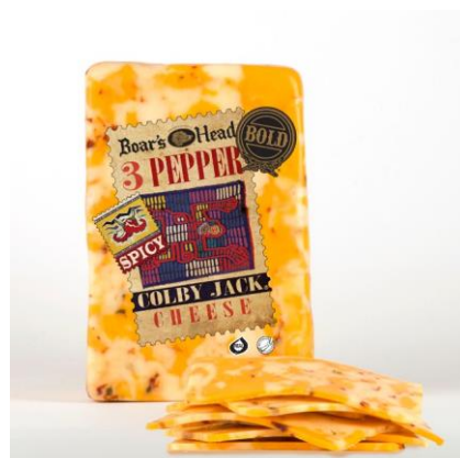
BOLD 3 PEPPER COLBY JACK 15061 3.5 LB | 2 PER CASE