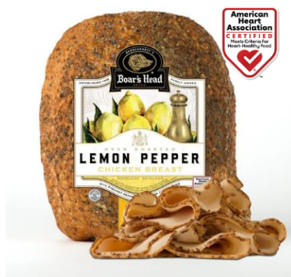
LEMON PEPPER CHICKEN 439 4.5 LB | 3 PER CASE