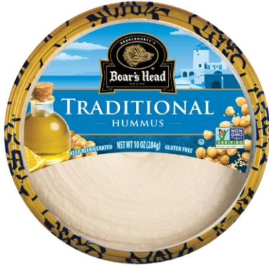
TRADITIONAL HUMMUS 16159 10 OZ | 12 PER CASE