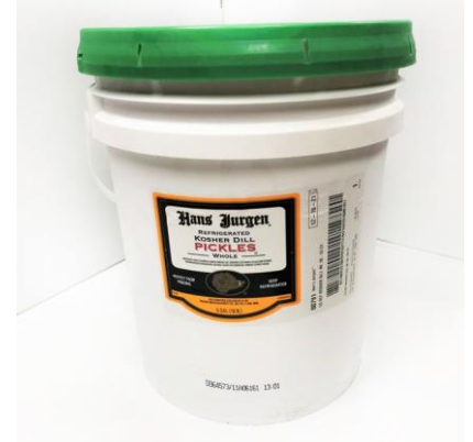
WHOLE PICKLES 791 50-60 COUNT | 5 GALLON