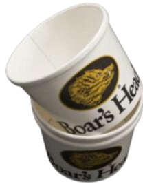
12 OZ SOUP CUP 94001 25 PER CASE