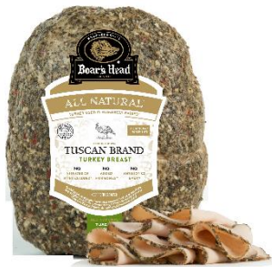
ALL-NATURAL TUSCAN TURKEY 13008 4 LB | 3 PER CASE