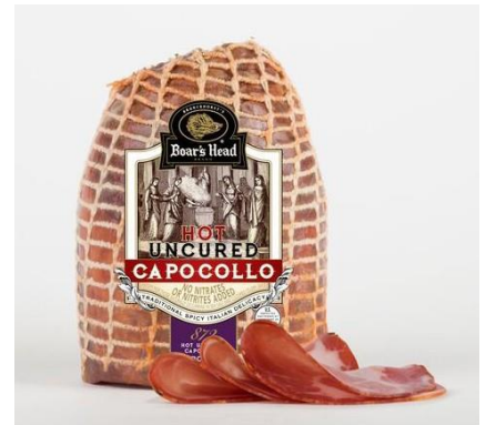
HOT CAPOCOLLO 872 1.5 LB | 12 PER CASE