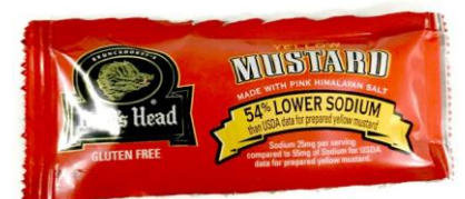
YELLOW MUSTARD PACKETS 16203 250 PER CASE