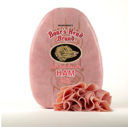
DELUXE BRANDED HAM 102 9.75 LB | 3 PER CASE