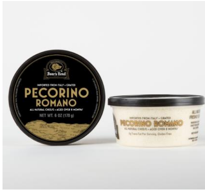
GRATED PECORINO 858 6 OZ | 12 PER CASE SPECIAL ORDER