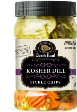
PICKLE CHIPS 16261 26 OZ | 12 PER CASE 100-120 CHIPS PER JAR