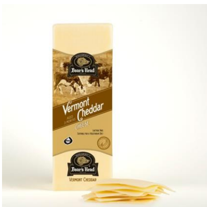
VERMONT WHITE CHEDDAR 628 5.5 LB | 2 PER CASE