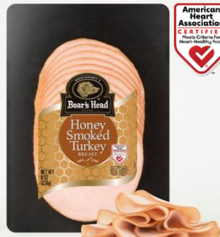
PS HONEY SMOKED TURKEY 50024 8 OZ | 12 PER CASE