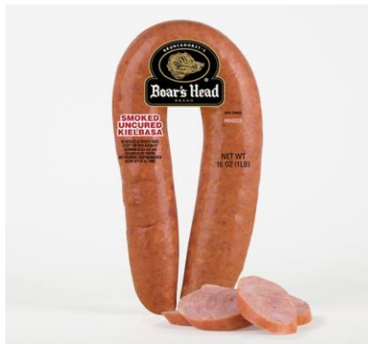
RING KIELBASA 14006 16 OZ | 8 PER CASE