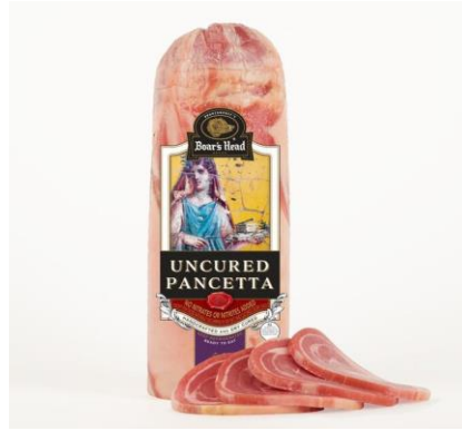
PANCETTA 545 3 LB | 3 PER CASE