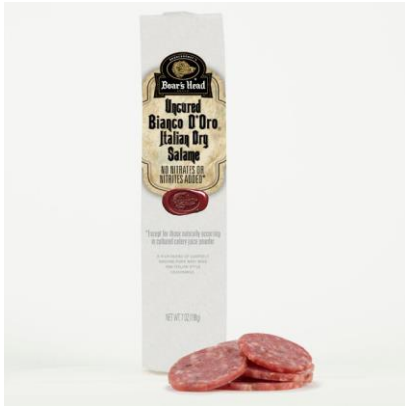
MINI BIANCO D'ORO SALAMI 16030 7 OZ | 15 PER CASE