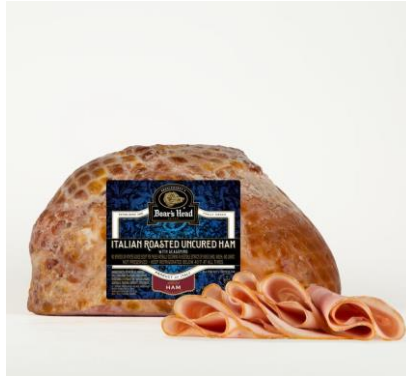
ITALIAN ROASTED UNCURED HAM 11022 6.5 LB | 2 PER CASE