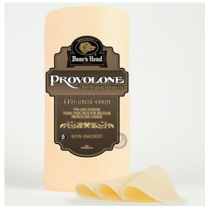
LOWER SODIUM PROVOLONE 668 6 LB | 6 PER CASE