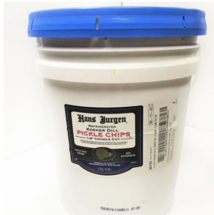
CRINKLE CUT CHIPS 793 1450-1550 COUNT | 5 GALLON