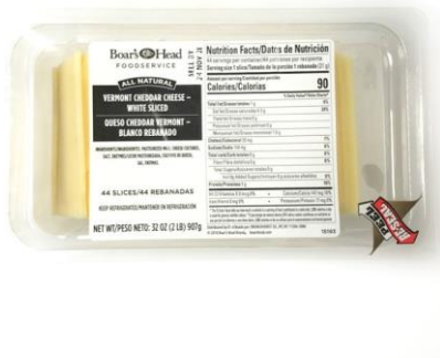
VERMONT WHITE CHEDDAR 15193 44 SLICE PACK | 6 PER CASE