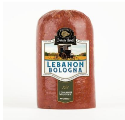
LEBANON BOLOGNA 781 3.75 LB | 3 PER CASE