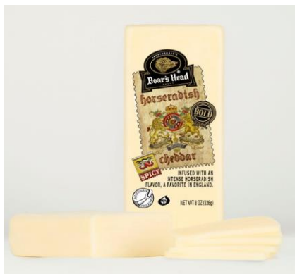
PC BOLD HORSERADISH CHEDDAR 966 8 OZ | 10 PER CASE