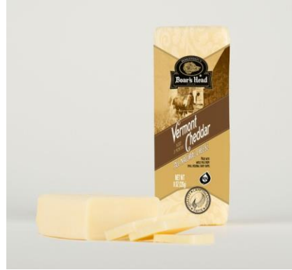
PC VERMONT WHITE 15012 8 OZ | 10 PER CASE