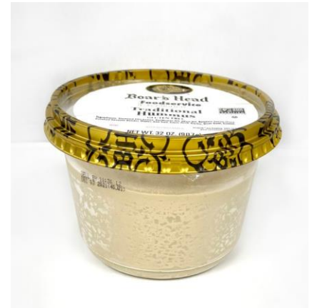
TRADITIONAL HUMMUS 16197 32 OZ | 6 PER CASE