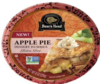
APPLE PIE HUMMUS 16277 8 OZ | 12 PER CASE | SEASONAL