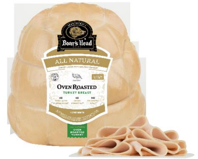
ALL-NATURAL ROASTED TURKEY 326 3.5 LB | 3 PER CASE