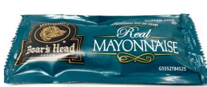
MAYO PACKETS 16267 250 PER CASE