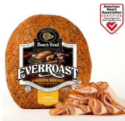
EVERROAST CHICKEN 13014 4.5 LB | 3 PER CASE