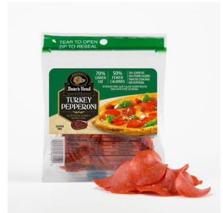
POUCH TURKEY PEPPERONI 16154 4.5 OZ | 16 PER CASE