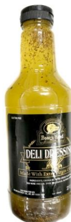
DELI DRESSING 16127 32 oz | 4 PER CASE