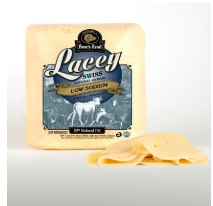
LACEY SWISS 670 6.5 LB | 2 PER CASE