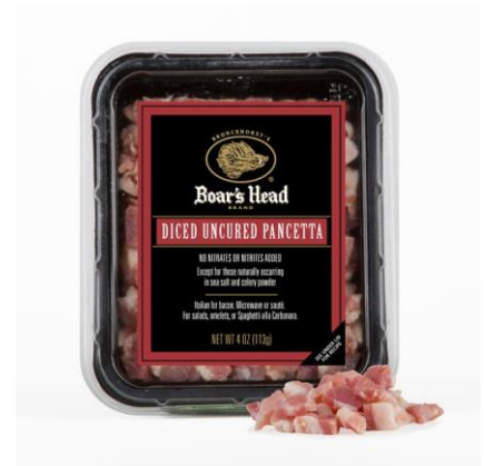
DICED PANCETTA 16088 4 OZ | 12 PER CASE