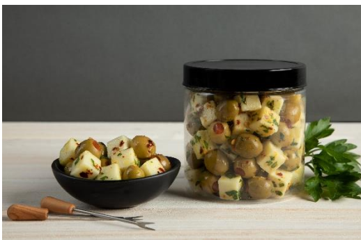
CASTELVETRANO OLIVE BLEND PAIRED WITH BOAR'S HEAD MANCHEGO CHEESE (15027) 70075 24 OZ | 6 PER CASE