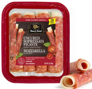
HOT SOPRESSATA & MOZZARELLA ROLL UP 16225 3 OZ | 12 PER CASE