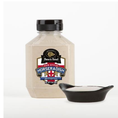
SQZ HORSERADISH SAUCE 16003 9.5 OZ | 12 PER CASE