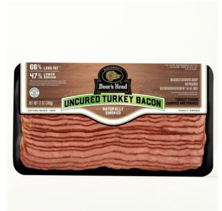
UNCURED TURKEY BACON 13066 12 OZ | 12 PER CASE