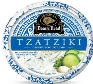
TZATZIKI GREEK YOGURT DIP 16260 12 OZ | 8 PER CASE