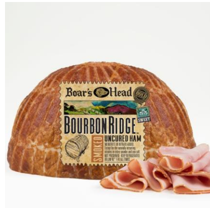
BOURBONRIDGE SMOKED HAM 11069 4 LB | 5 PER CASE