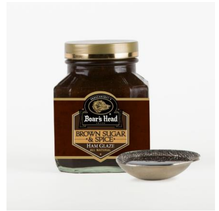
SUGAR & SPICE HAM GLAZE JAR 957 11 OZ | 12 PER CASE