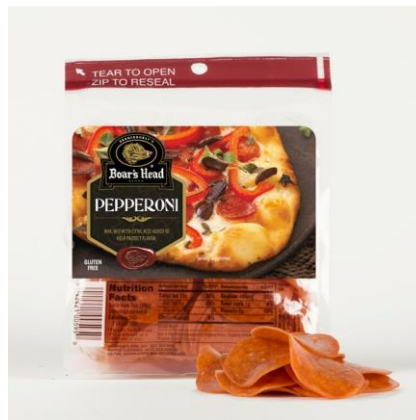
POUCH PEPPERONI 595 6 OZ | 16 PER CASE