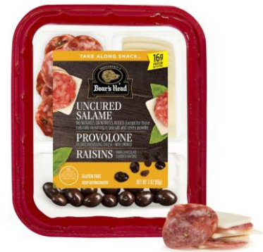
SALAME, PROVOLONE & CHOCOLATE RAISIN 16215 3 OZ | 12 PER CASE