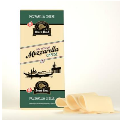
WHOLE MILK MOZZARELLA 620 6 LB | 2 PER CASE