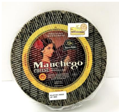
MANCHEGO WHEEL 15049 10 LB | 2 PER CASE SPECIAL ORDER