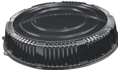
CATERING TRAY LID 96334 25 PER CASE