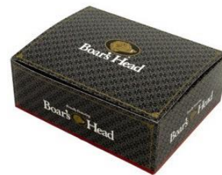
CATERING LUNCH BOX 92034 100 PER CASE