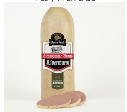
LIVERWURST 368 3 LB | 4 PER CASE