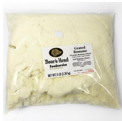
GRATED PERCORINO ROMANO 15119 5 LB | 4 PER CASE SPECIAL ORDER