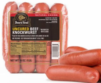
UNCURED BEEF KNOCKWURST 410 16 OZ | 12 PER CASE