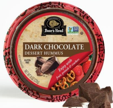
DARK CHOCOLATE DESSERT HUMMUS 16216 8 OZ | 12 PER CASE