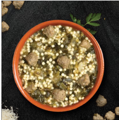
ITALIAN WEDDING SOUP 16117 8 LB | 2 PER CASE