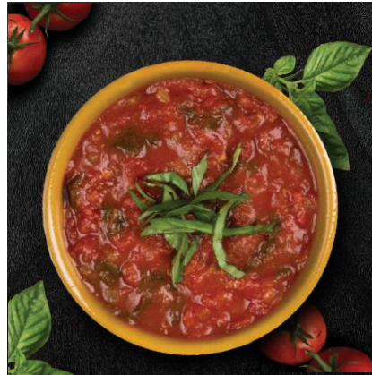
TOMATO BASIL 16128 8 LB | 2 PER CASE