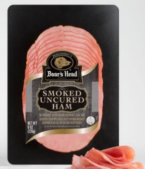
PS SMOKED HAM 50026 8 OZ | 12 PER CASE