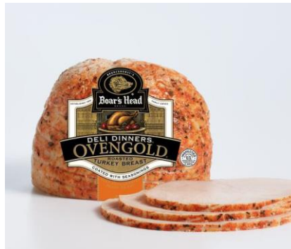
BABY OVENGOLD TURKEY 305 1.5 LB | 5 PER CASE