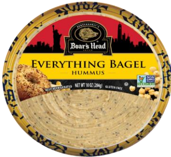
EVERYTHING BAGEL HUMMUS 16237 10 OZ | 12 PER CASE