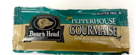
PEPPERHOUSE PACKETS 16266 250 PER CASE