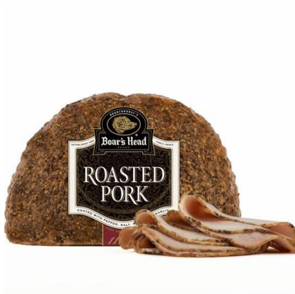
ROASTED PORK 11066 4 LB | 5 PER CASE