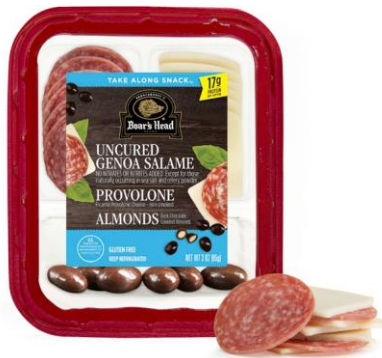
GENOA SALAME, PROVOLONE & CHOCOLATE RAISIN 16214 3 OZ | 12 PER CASE