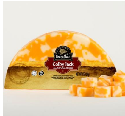
PC COLBY JACK 968 8 OZ | 10 PER CASE