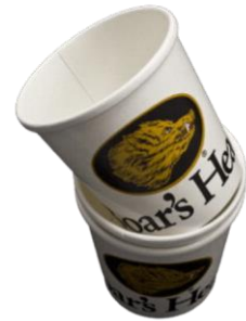
16 OZ SOUP CUP 94002 25 PER CASE