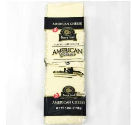
SLICED AMERICAN WHITE 647 160 SLICES | 6 PER CASE