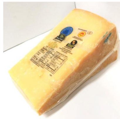
PARMIGIANO REGGIANO 15201 12 LB WEDGE | 5 PER CASE SPECIAL ORDER