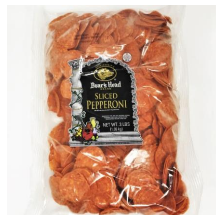
PIZZA PEPPERONI 527 3 LB BAG | 4 PER CASE

LAYOUT BACON CANADA | 70013 | 15 LB | 18-22 SLICES PER POUND