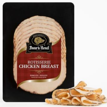
PS ROTISSERIE CHICKEN BREAST 50084 8 OZ | 12 PER CASE