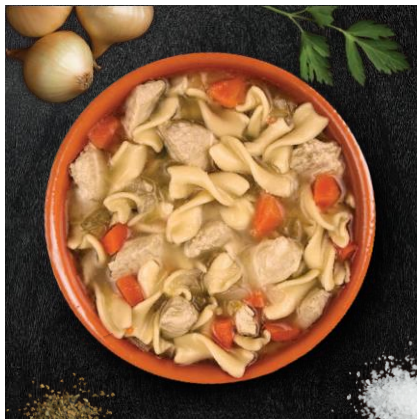
CHICKEN NOODLE SOUP 16226 4 LB | 4 PER CASE