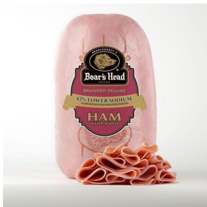
LOW SALT DELUXE HAM 159 5.4 LB | 6 PER CASE