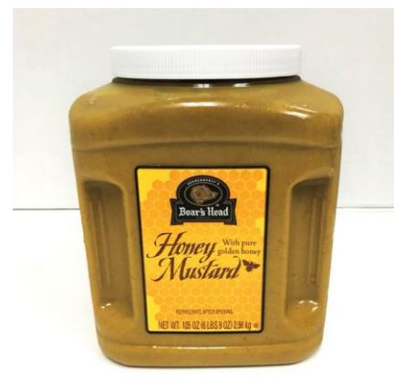
HONEY MUSTARD 16264 105 OZ | 4 PER CASE