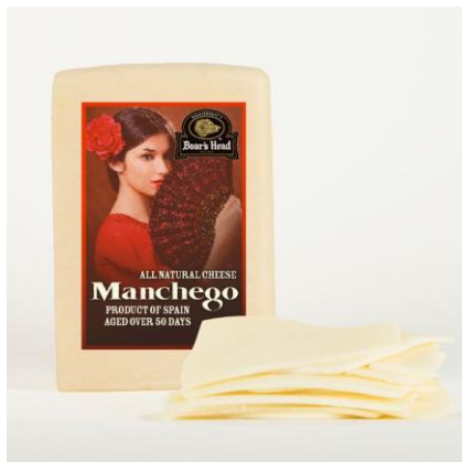
SLICING MANCHEGO 15027 3.5 LB | 2 PER CASE