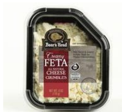
CRUMBLED FETA 932 6 OZ | 6 PER CASE