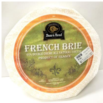
BRIE WHEEL 15054 12 LB | 1 PER CASE SPECIAL ORDER