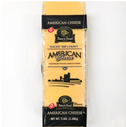
SLICED AMERICAN YELLOW 644 160 SLICES | 6 PER CASE