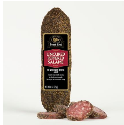
PEPPERED SALAMI 16093 8 OZ | 15 PER CASE