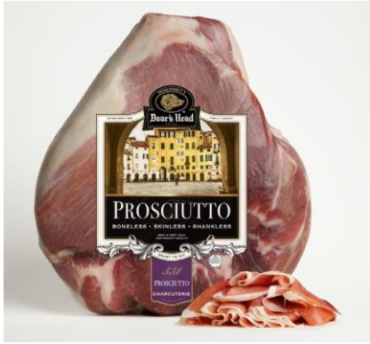
OLD FASHIONED PROSCIUTTO 531 7.5 LB | 1 PER CASE