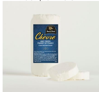
PC OLD WORLD CHEVRE 15041 4 OZ | 12 PER CASE