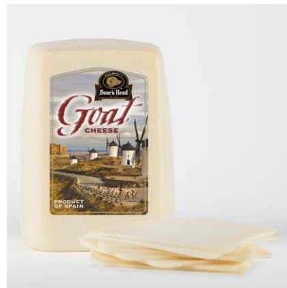
SLICING GOAT CHEESE 15024 3.5 LB | 2 PER CASE SPECIAL ORDER