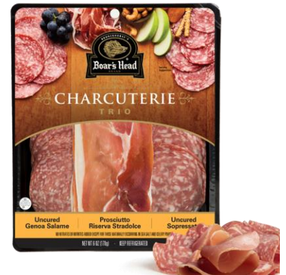
CHARCUTERIE TRIO 16279 6 OZ | 12 PER CASE