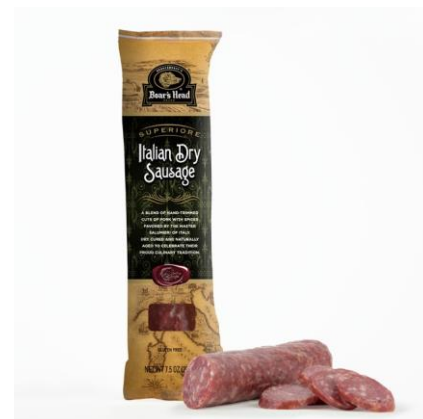
SUPERIORE ITALIAN SAUSAGE 16189 7.5 OZ | 23 PER CASE