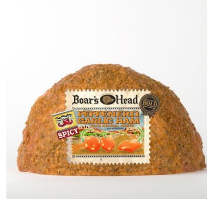
PEPPENERO GARLIC HAM 11044 4 LB | 4 PER CASE