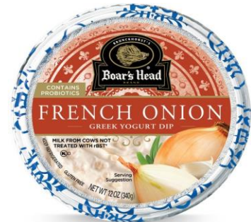
FRENCH ONION GREEK YOGURT DIP 16276 12 OZ | 8 PER CASE