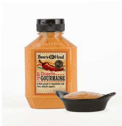
SQZ CHIPOTLE GOURMAISE 16132 8.5 OZ | 12 PER CASE