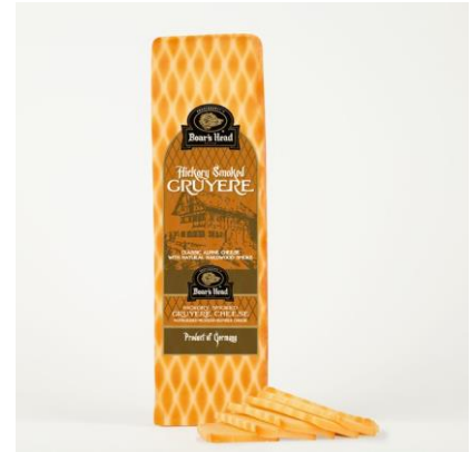
HICKORY SMOKED GRUYERE 658 2.5 LB | 2 PER CASE