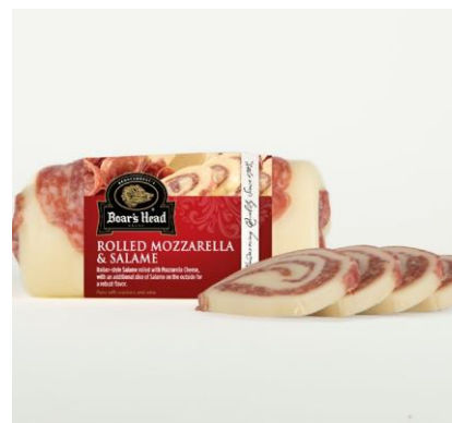
SALAME PANINO 16071 8 OZ | 12 PER CASE