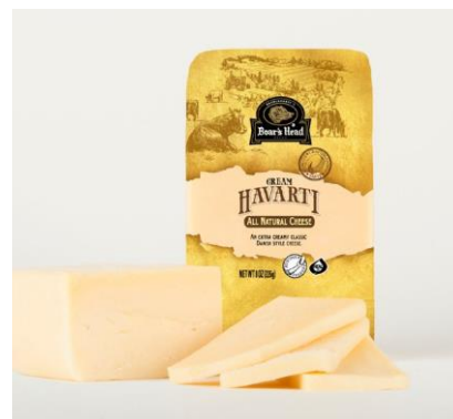
PC HAVARTI 976 8 OZ | 10 PER CASE