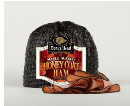
BABY MAPLE HONEY HAM 193 1.5 LB | 5 PER CASE