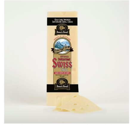
SWITZERLAND SWISS 682 7.5 LB | 4 PER CASE