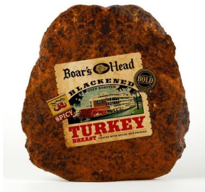
BOLD BLACKENED TURKEY 13033 4.5 LB | 4 PER CASE