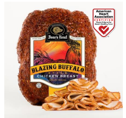
BLAZING BUFFALO CHICKEN 440 4.5 LB | 3 PER CASE

NO GLUTEN* | NO ARTIFICIAL COLORS OR FLAVORS | NO MSG ADDED | NO FILLERS OR BY PRODUCTS | NO TRANS FAT** *All Boar's Head meats, cheeses, spreads and condiments are gluten free. **No trans-fats from partially hydrogenated oils