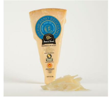
PC PARMIGIANO REGGIANO 15161 7 OZ | 14 PER CASE