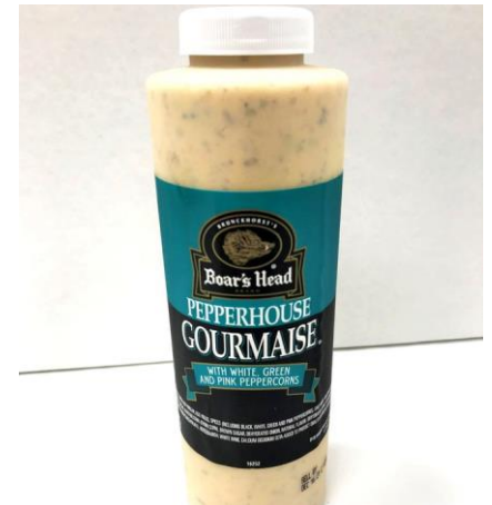
PEPPERHOUSE GOURMAISE 16252 16 OZ | 6 PER CASE