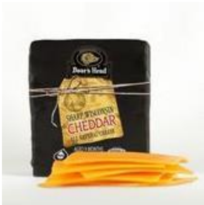
WISCONSIN SHARP BLACK WAX 15206 3.28 LB | 4 PER CASE