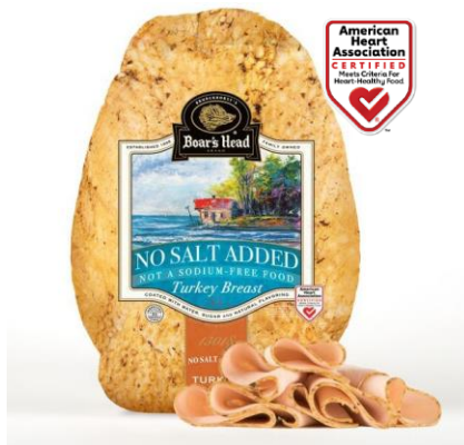
NO SALT ADDED TURKEY 13018 3.5 LB | 3 PER CASE