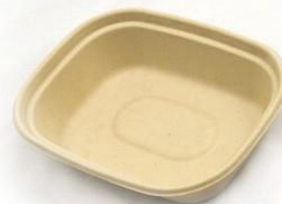
COMPOSTABLE BOWL 90512 400 PER CASE