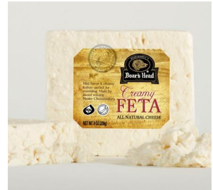
PC FETA 971 8 OZ | 10 PER CASE