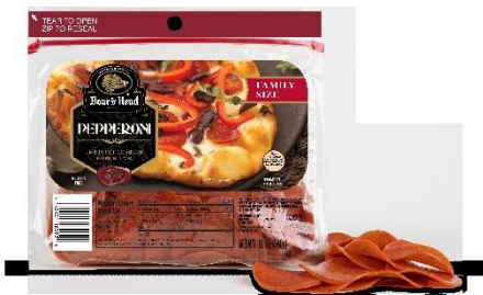
POUCH PEPPERONI 16290 12 OZ | 8 PER CASE

NO GLUTEN* | NO ARTIFICIAL COLORS OR FLAVORS | NO MSG ADDED | NO FILLERS OR BY PRODUCTS | NO TRANS FAT** *All Boar's Head meats, cheeses, spreads and condiments are gluten free. **No trans-fats from partially hydrogenated oils