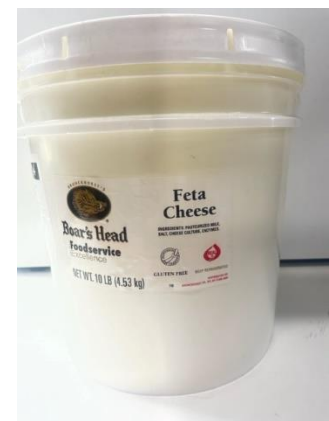
FETA CHEESE BUCKET 748 5 LB | 1 BUCKET