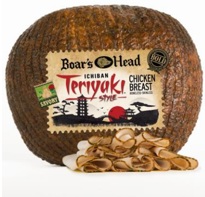
BOLD ICHIBAN TERIYAKI CHICKEN 13044 4 LB | 3 PER CASE