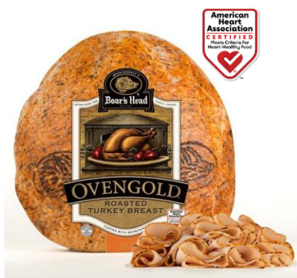
OVINGOLD TURKEY 278 9 LB | 2 PER CASE