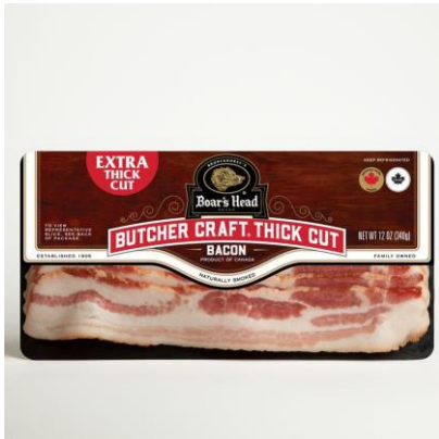
RAW THICK CUT BACON 11046 12 OZ | 12 PER CASE