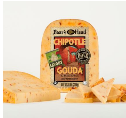
PC BOLD CHIPOTLE GOUDA 15070 8 OZ | 10 PER CASE