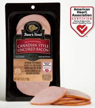
PS CANADIAN BACON 50087 6 OZ | 12 PER CASE