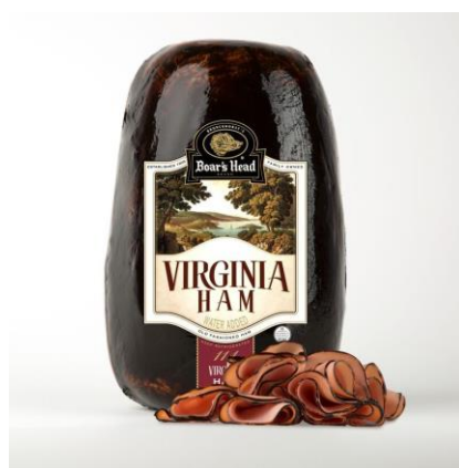
VIRGINIA HAM 442 5.4 LB | 6 PER CASE

NO GLUTEN* | NO ARTIFICIAL COLORS OR FLAVORS | NO MSG ADDED | NO FILLERS OR BY PRODUCTS | NO TRANS FAT** *All Boar's Head meats, cheeses, spreads and condiments are gluten free. **No trans-fats from partially hydrogenated oils