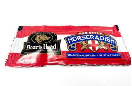
HORSERADISH PACKETS 785 250 PER CASE