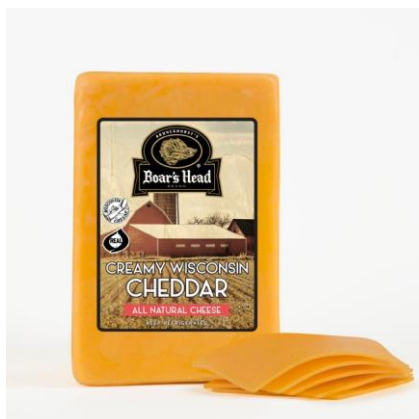
SWEET WISCONSIN CHEDDAR 15178 5 LB | 2 PER CASE