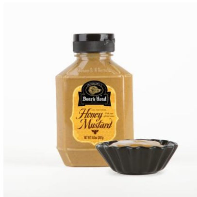
SQZ HONEY MUSTARD 16002 10.5 OZ | 12 PER CASE