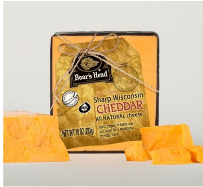
PC WISCONSIN BLACK WAX CHEDDAR 963 10 OZ | 10 PER CASE