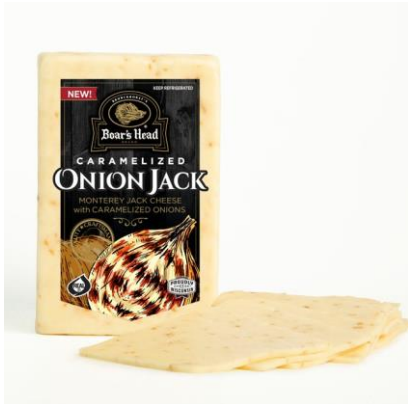
CARAMELIZED ONION JACK 15217 2.5 LB | 2 PER CASE