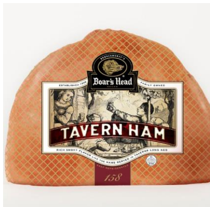
TAVERN HAM 11005 5.4 LB | 3 PER CASE