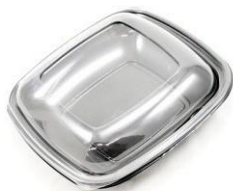
SALAD BOWL LIDS 90526 150 PER CASE