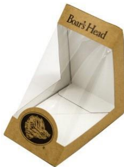
SANDWICH WEDGE BOX 90511 300 WEDGES PER CASE