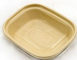
COMPOSTABLE LID 90513 400 PER CASE