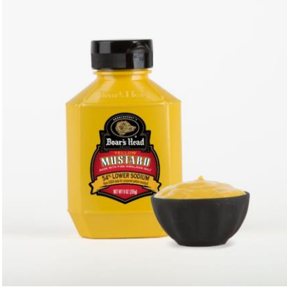
SQZ YELLOW MUSTARD 16202 9 OZ | 12 PER CASE