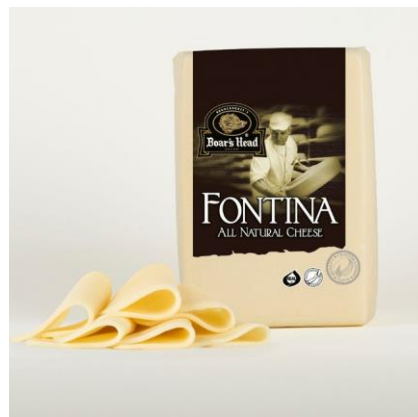
FONTINA 757 3.5 LB | 2 PER CASE