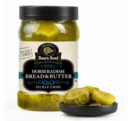
HORSERADISH BREAD & BUTTER CHIPS 485 15.5 OZ | 12 PER CASE 24-30 CHIPS PER JAR