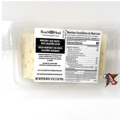
PEPPER JACK 15191 44 SLICE PACK | 6 PER CASE