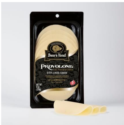
PS LOW SODIUM PROVOLONE 50007 8 OZ | 12 PER CASE