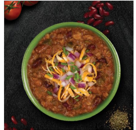
TURKEY CHILI W/ BEANS 16198 8.16 LB | 2 PER CASE