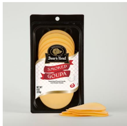
PS SMOKED GOUDA 50039 8 OZ | 12 PER CASE