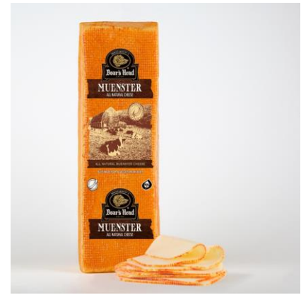
MUENSTER 654 6 LB | 6 PER CASE