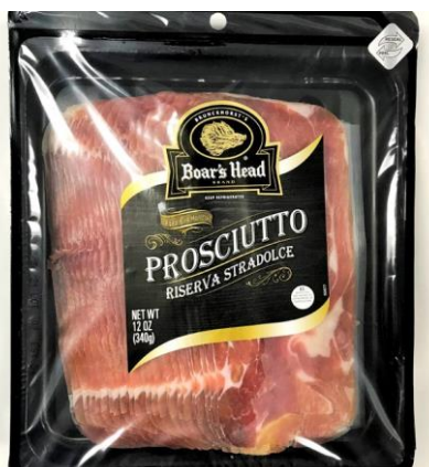
PROSCIUTTO 50077 12 OZ PACK | 6 PER CASE SPECIAL ORDER