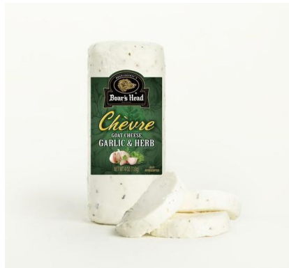
PC GARLIC & HERB CHEVRE 15209 4 OZ | 12 PER CASE