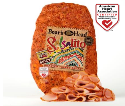
BOLD SALSALITO TURKEY 284 4 LB | 4 PER CASE