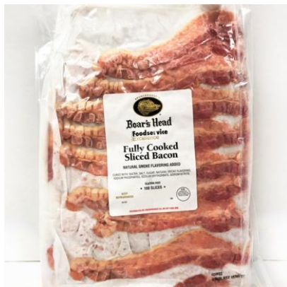
PRE-COOKED BACON 533 100 SLICE BAG | 3 PER CASE