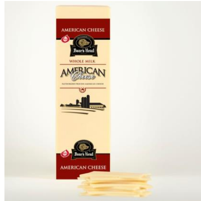
AMERICAN WHITE 653 5 LB | 6 PER CASE