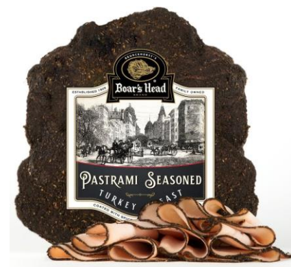
PASTRAMI SEASONED TURKEY 275 4.5 LB | 4 PER CASE