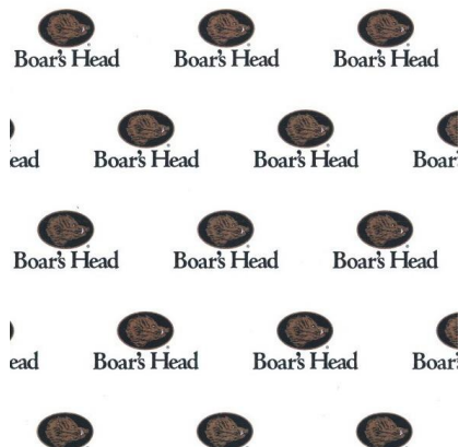
DELI WRAP PAPER 90195 1800 SHEETS | 14" x 18"