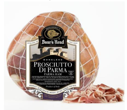
PROSCIUTTO DI PARMA 16147 14 LB | 1 PER CASE