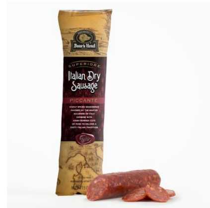
SUPERIORE ITALIAN SAUSAGE HOT 16188 7.5 OZ | 23 PER CASE