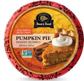
PUMPKIN PIE HUMMUS 16258 8 OZ | 12 PER CASE | SEASONAL