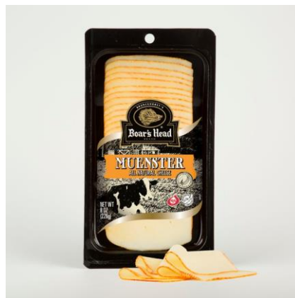
PS MUENSTER 50010 8 OZ | 12 PER CASE