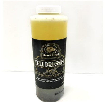
DELI DRESSING 16249 16 OZ | 6 PER CASE