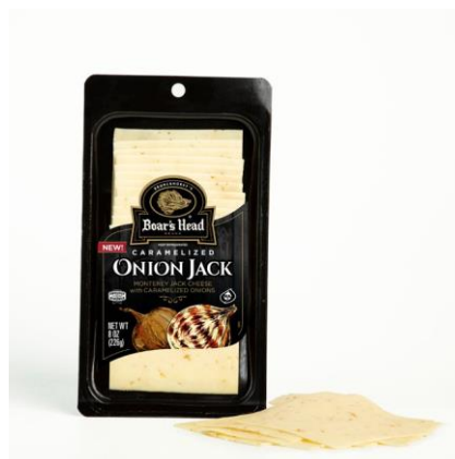
PS CARAMELIZED ONION JACK 50091 8 OZ | 12 PER CASE