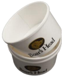
8 OZ SOUP CUPS 94000 25 PER CASE