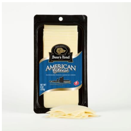
PS AMERICAN WHITE 50012 8 OZ | 12 PER CASE