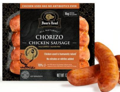
CHORIZO CHICKEN SAUSAGE 14025 12 OZ | 12 PER CASE