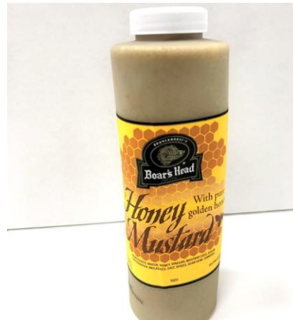
HONEY MUSTARD 16251 16 OZ | 6 PER CASE