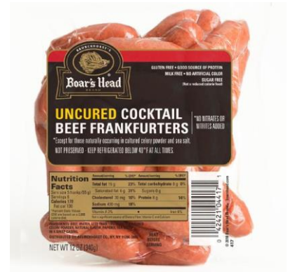
UNCURED COCKTAIL BEEF FRANKFURTERS 417 12 OZ | 12 PER CASE