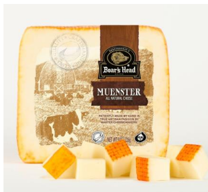
PC MUNSTER 981 8 OZ | 10 PER CASE