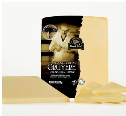
PC BLANC GRUE GRUYERE 974 8 OZ | 10 PER CASE