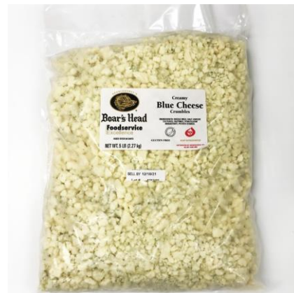
CRUMBLLED BLUE CHEESE 15006 5 LB | 2 PER CASE