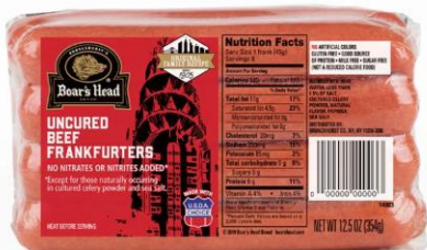
SKINLESS UNCURED BEEF FRANKS 14003 12.5 OZ | 12 PER CASE