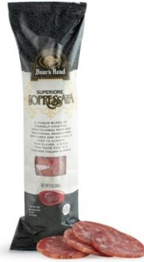
SUPERIORE SOPRESSATA 16191 9 OZ | 15 PER CASE