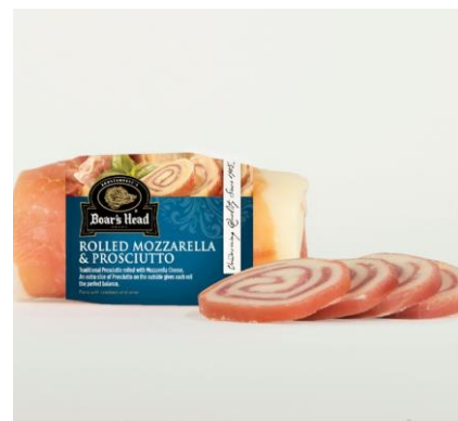
PROSCIUTTO PANINO 16072 8 OZ | 12 PER CASE