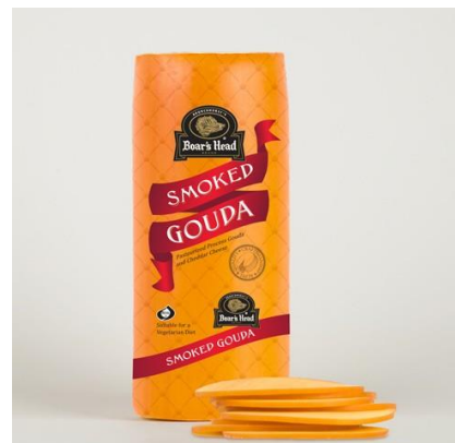
SMOKED GOUDA 15035 3.5 LB | 4 PER CASE