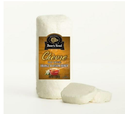
PC HONEY CHEVRE 15210 4 OZ | 12 PER CASE