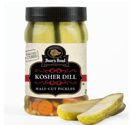
1/2 CUT PICKLES 488 26 OZ | 12 PER CASE 11-15 HALVES PER JAR