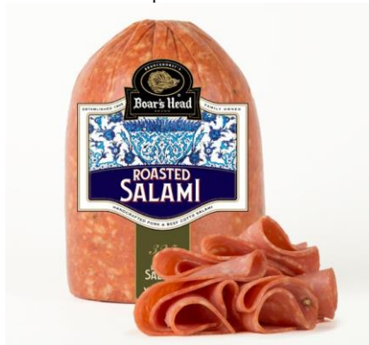
ROASTED SALAMI 325 3.5 LB | 4 PER CASE