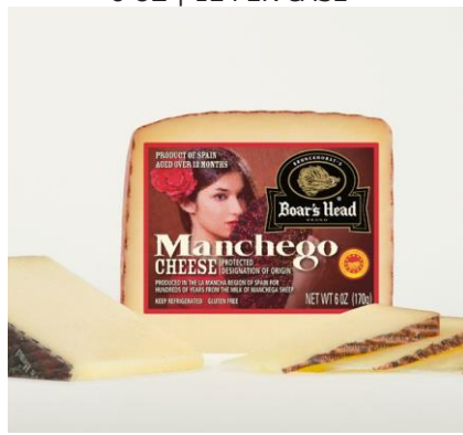
PC MANCHEGO 15164 6 OZ | 10 PER CASE