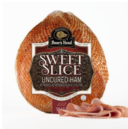
SWEET SLICE HAM 153 6 LB | 4 PER CASE