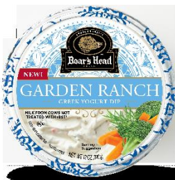
GARDEN RANCH GREEK YOGURT DIP 16282 12 OZ | 8 PER CASE

NO GLUTEN* | NO ARTIFICIAL COLORS OR FLAVORS | NO MSG ADDED | NO FILLERS OR BY PRODUCTS | NO TRANS FAT** *All Boar's Head meats, cheeses, spreads and condiments are gluten free. **No trans-fats from partially hydrogenated oils