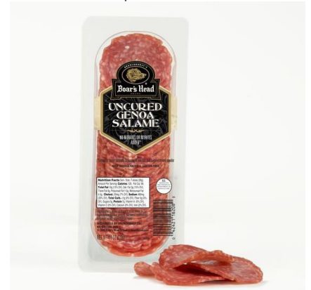
SLICED GENOA SALAME SNACK TRAY 16208 4.6 OZ | 20 PER CASE