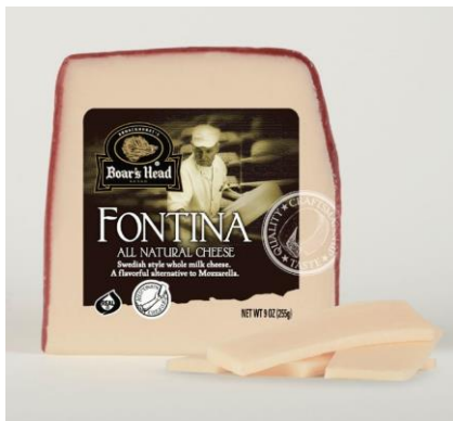
PC SWEDISH STYLE FONTINA 972 9 OZ | 10 PER CASE