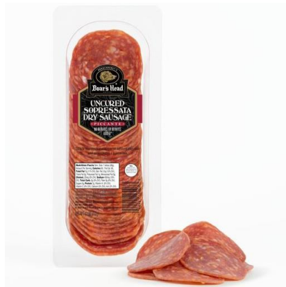
SLICED SOPRESSA PICANTE SNACK TRAY 16207 4 OZ | 20 PER CASE