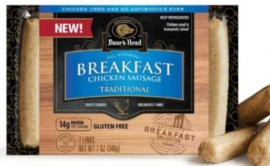
BREAKFAST CHICKEN SAUSAGE 14028 7 OZ | 12 PER CASE