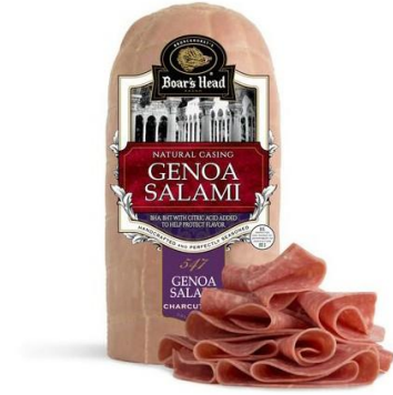
GENOA SALAMI 547 4 LB | 8 PER CASE