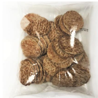
BREAKFAST SAUSAGE 11034 5 LB BAGS | 2 PER CASE