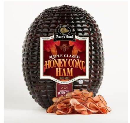
MAPLE HONEY HAM 150 7.25 LB | 4 PER CASE