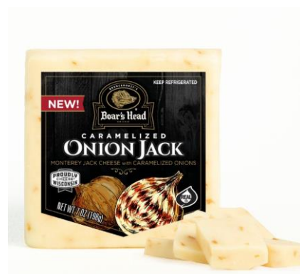
PC CARAMELIZED ONION JACK 15218 7 OZ | 10 PER CASE