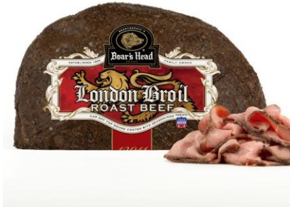
LONDON BROIL 12011 5.5 LB | 4 PER CASE