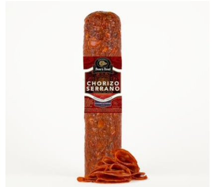
OLD WORLD CHORIZO SERRANO 16113 3 LB | 4 PER CASE