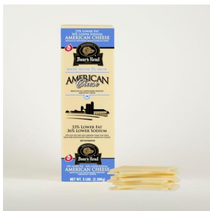
LS/LF AMERICAN WHITE 713 5 LB | 2 PER CASE