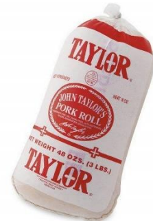
TAYLOR PORK ROLL 572 3 LB | 4 PER CASE