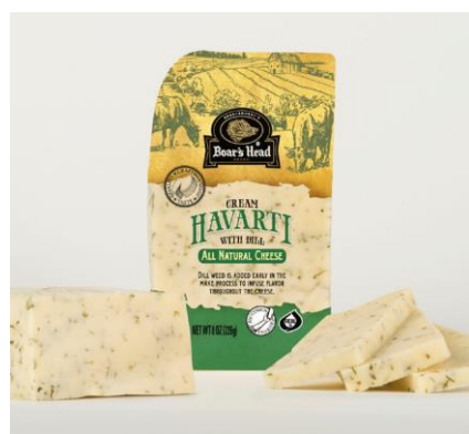
PC HAVARTI DILL 977 8 OZ | 10 PER CASE