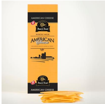
AMERICAN YELLOW 652 5 LB | 6 PER CASE