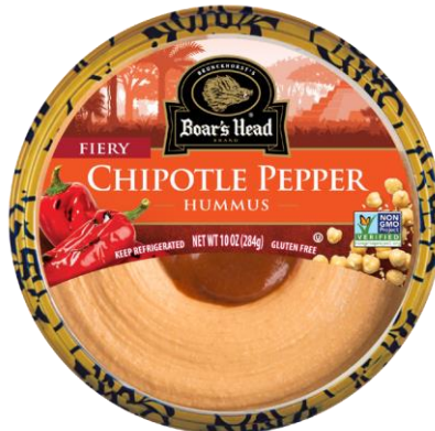
BOLD CHIPOTLE HUMMUS 16163 10 OZ | 12 PER CASE