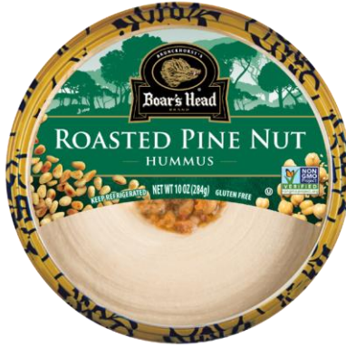
ROASTED PINE NUT HUMMUS 16160 10 OZ | 12 PER CASE