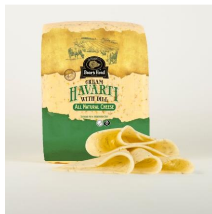
HAVARTI DILL 726 4.5 LB | 2 PER CASE