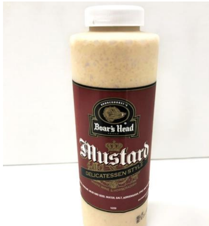
DELI MUSTARD 16250 16 OZ | 6 PER CASE