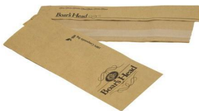
BRANDED SANDWICH BAGS 90514 500 PER CASE