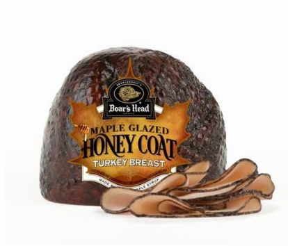
BABY MAPLE HONEY TURKEY 194 1.5 LB | 5 PER CASE