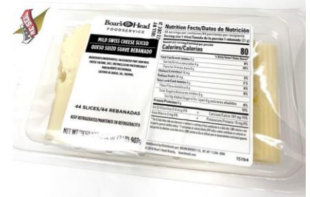
DOMESTIC SWISS 15194 44 SLICE PACK | 6 PER CASE