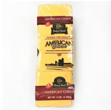
SLICED AMERICAN YELLOW 645 120 SLICES | 6 PER CASE