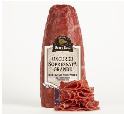
SWEET SOPRESSATA GRANDE 597 4.5 LB | 6 PER CASE