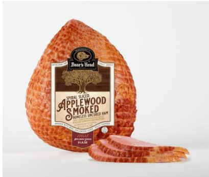
APPLEWOOD SPIRAL HAM 11038 3.5 LB | 5 PER CASE