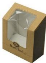
WRAP PACK 90530 500 PER CASE