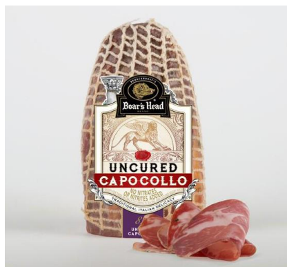
CAPOCOLLO 873 1.5 LB | 12 PER CASE

NO GLUTEN* | NO ARTIFICIAL COLORS OR FLAVORS | NO MSG ADDED NO FILLERS OR BY PRODUCTS | NO TRANS FAT** *All Boar's Head meats, cheeses, spreads and condiments are gluten free. **No trans-fats from partially hydrogenated oils