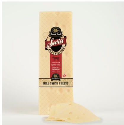
DOMESTIC MILD SWISS 663 7.5 LB | 4 PER CASE