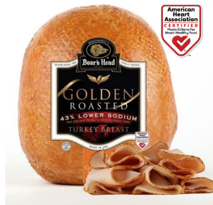
GOLDEN ROASTED TURKEY 441 6 LB | 3 PER CASE

NO GLUTEN* | NO ARTIFICIAL COLORS OR FLAVORS | NO MSG ADDED | NO FILLERS OR BY PRODUCTS | NO TRANS FAT** *All Boar's Head meats, cheeses, spreads and condiments are gluten free. **No trans-fats from partially hydrogenated oils