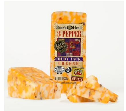
PC BOLD 3 PEPPER COLBY JACK 15071 8 OZ | 10 PER CASE