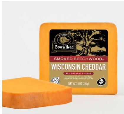
PC BEECHWOOD SMOKED CHEDDAR 15184 8 OZ | 10 PER CASE